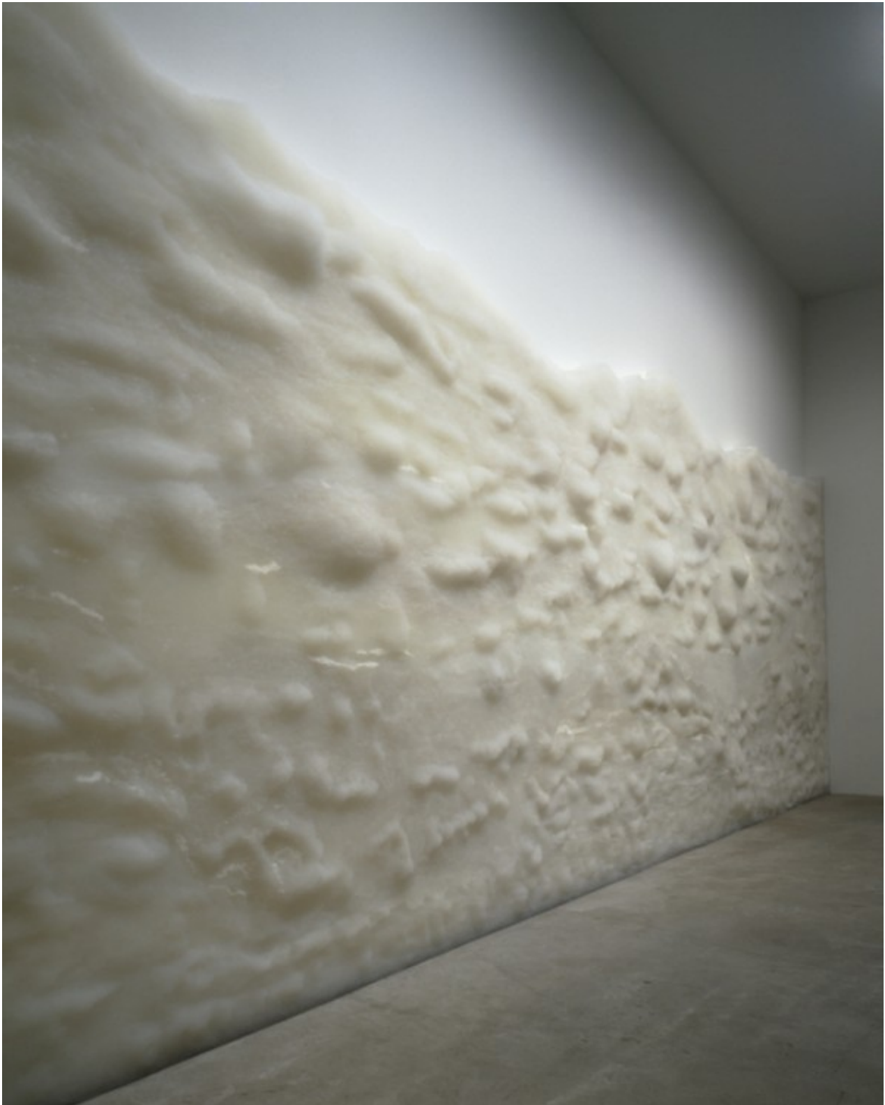
Tara Donovan, Haze , 2003. Translucent plastic drinking straws, installation dimensions variable.