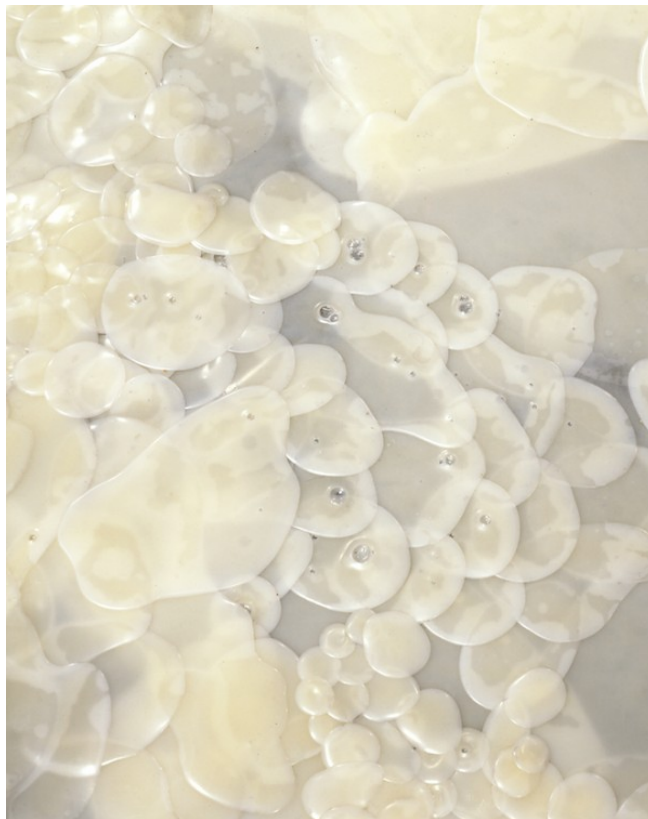
Tara Donovan, detail from Strata , 2000/2010. Elmer's glue, installation dimensions variable.