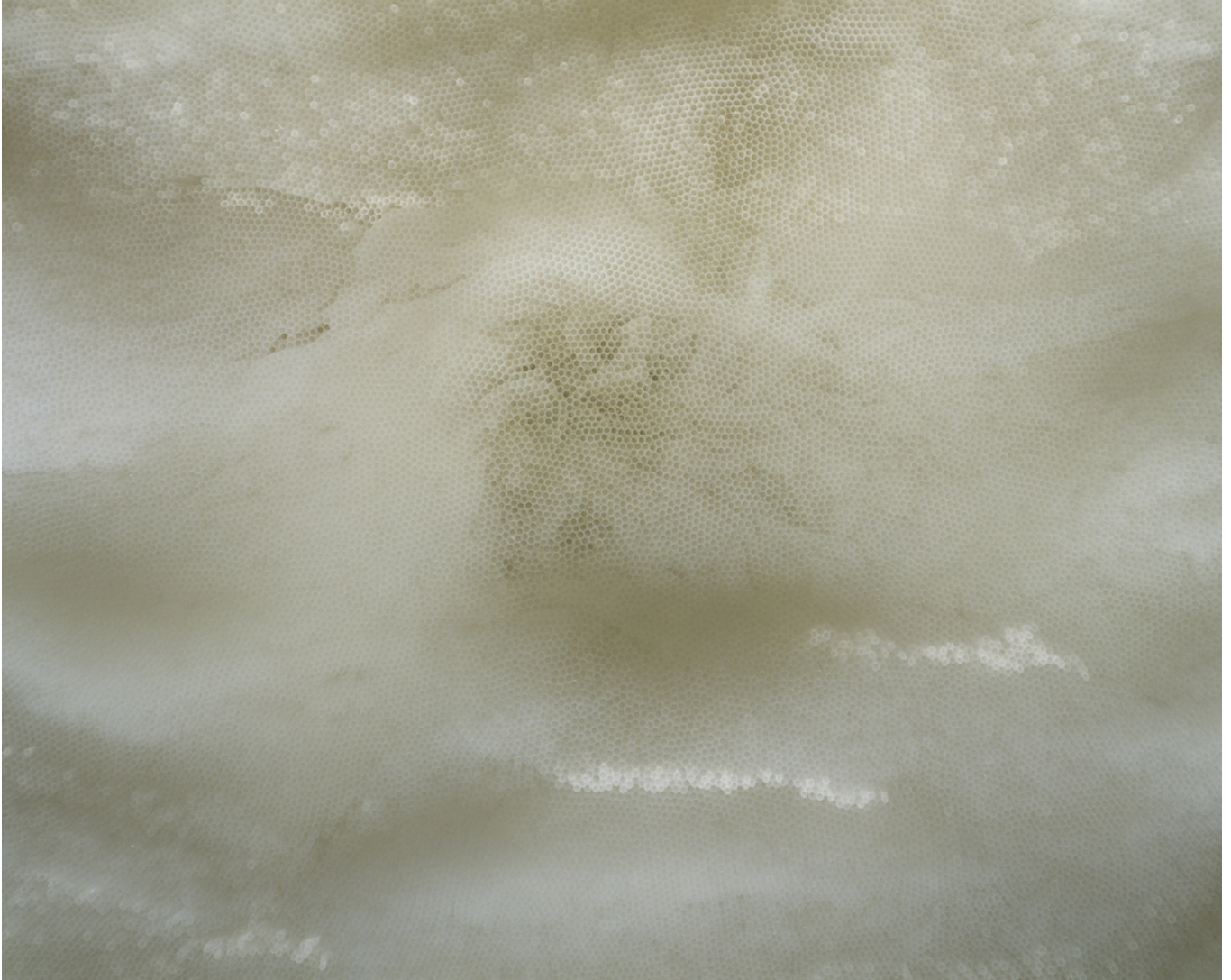
Tara Donovan, detail from Haze , 2003. Translucent plastic drinking straws, installation dimensions variable.