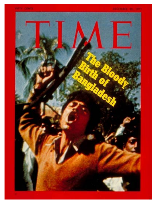
Cover of Time magazine, December 20, 1971. Published four days after the liberation of Bangladesh.