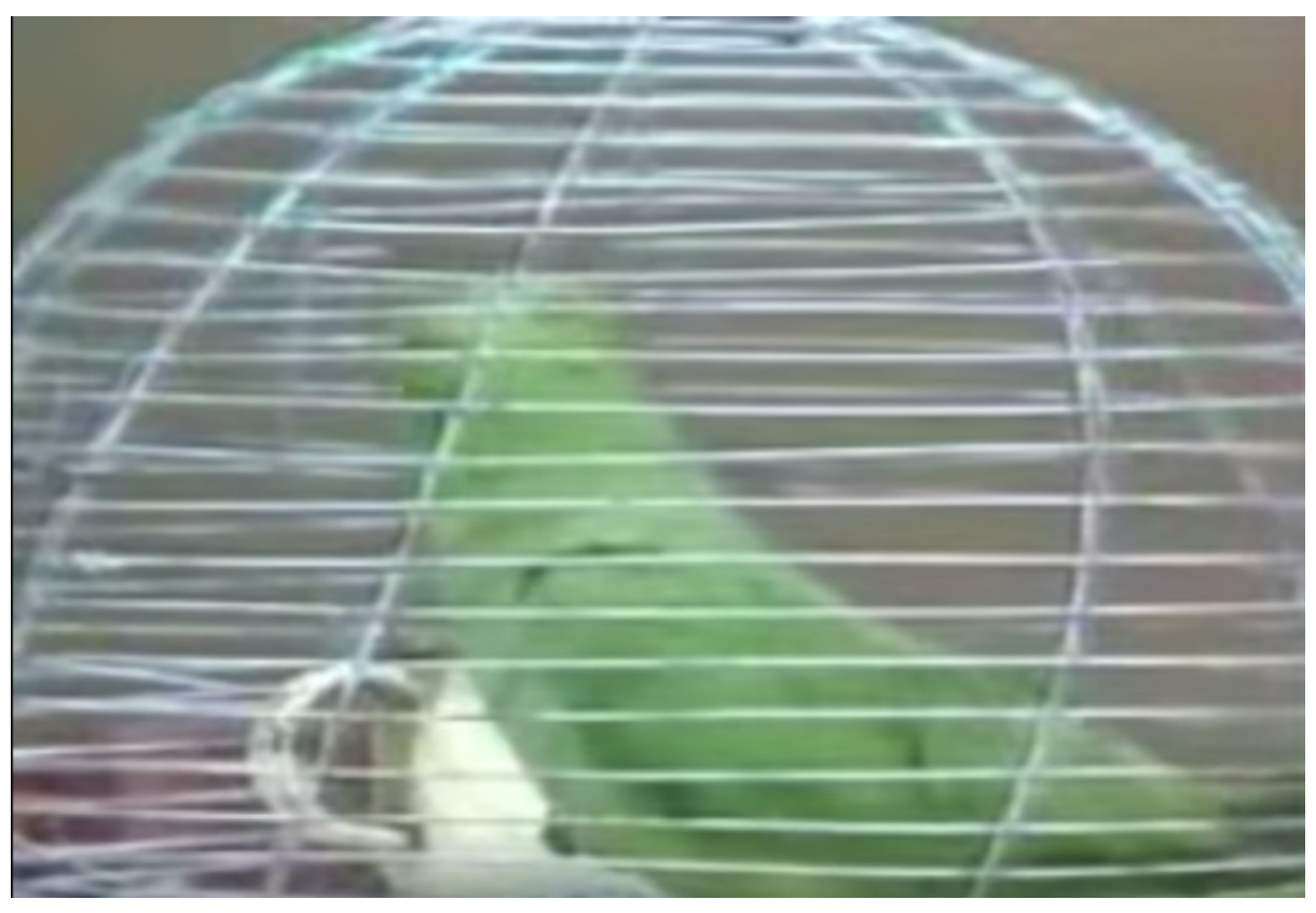
\label{thm:conformation} The \textit{\it Tui Razakar!} \ parrot \ confronts \ actor \ Abul \ Hayat \ in \ Humayun \ Ahmed's \ serial \ \textit{\it Bohubrihi.}