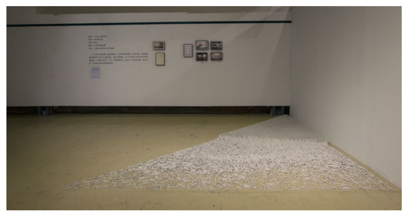
Qian Weikang, One Divided into Two Is Not Enough, 1993, 2015.