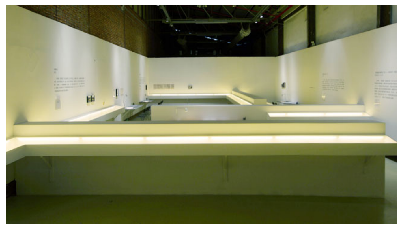
View of the exhibition "New Measurement Group," 2015.