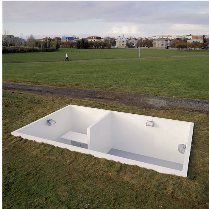
Elmgreen & Dragset, Dug Down Gallery / Powerless Structures , 1998. Installation view: Reykjavik Art Museum, Reykjavik, Iceland.

Enter the white cube, with its even walls and its unobtrusive artificial lighting – a sacred space that (despite its modern design) resembles an ancient tomb, undisturbed by time and containing infinite riches. O’Doherty uses this analogy of the tomb and the treasury to illuminate how the white cube was constructed in order to give the artworks a timeless quality (and thus, lasting value) in both an economic and a political sense. It was a space for the immortality of a certain class or caste’s cultural values, as well as a staging ground for objects of sound economic investment for possible buyers. O’Doherty thus reminds us that galleries are shops – spaces for producing surplus value, not use value – and as such, the modern gallery employs the formula of the white cube for an architectonics of transcendence in which the specificities of time and of place are replaced by the eternal. In other words, the white cube establishes a crucial dichotomy between that which is to be kept outside (the social and the political) and that which is inside (the staying value of art).