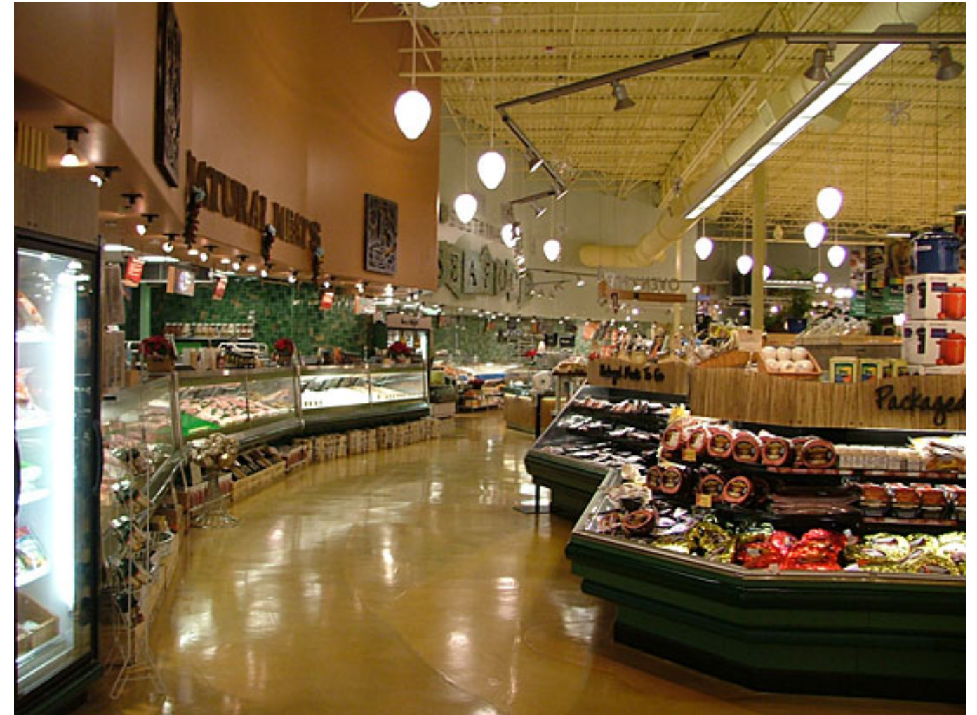
Whole Foods aisles