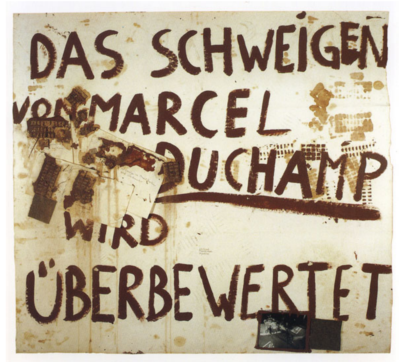
Joseph Beuys, Das Schweigen von Marcel Duchamp wird Überbewertet (The Silence Of Marcel Duchamp Is Overrated), 1964. Oil, paper, ink, felt, chocolate, photographs.