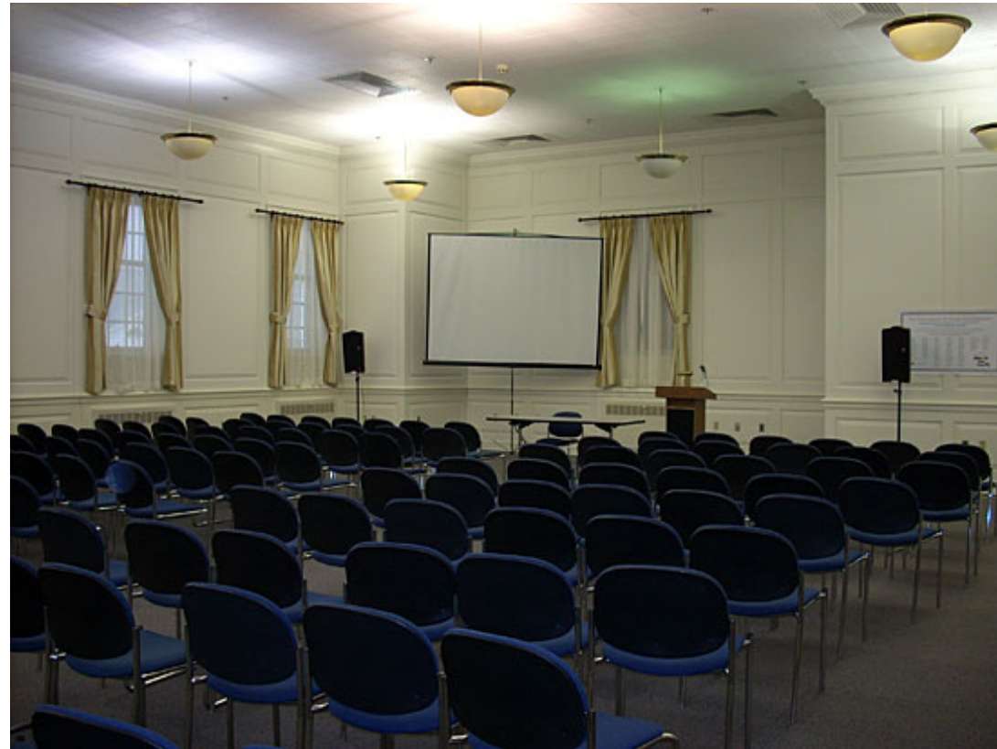
6137 McKeldin Library at the University of Maryland