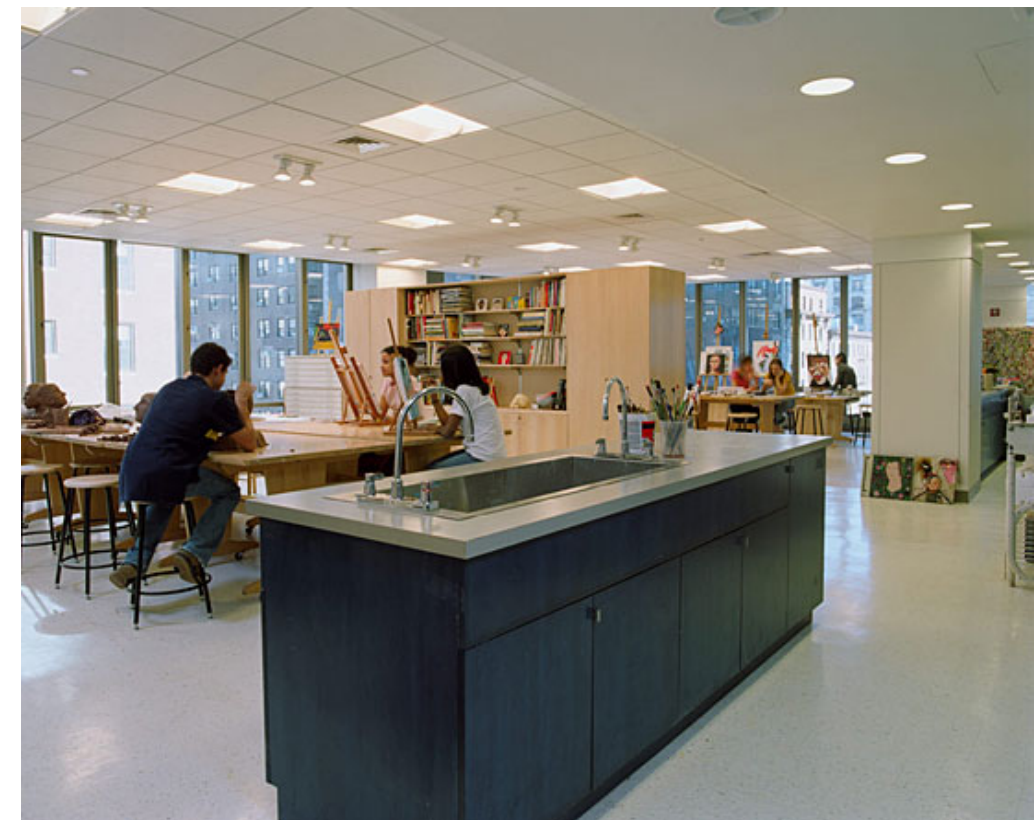
Art Classroom at The Calhoun School