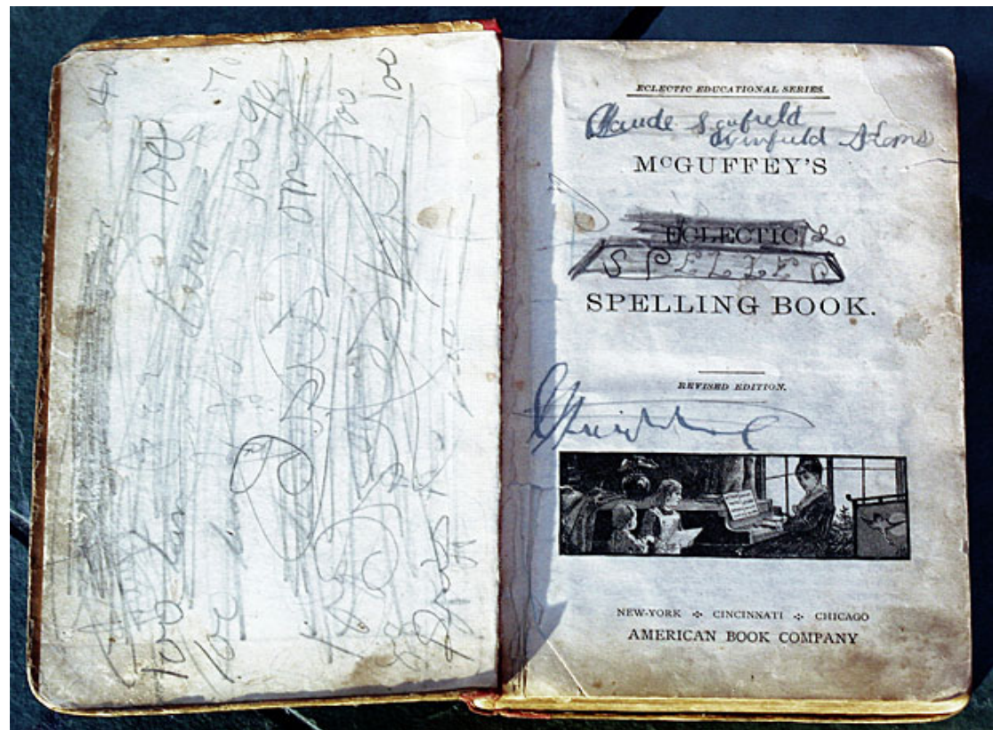
McGuffey's Eclectic Spelling Book, published in 1879.

The teaching of reading and writing has been a major part of the schooling mission for over two centuries. It has also been on the minds of countless specialists who ponder gaps in formal education in both expected and unexpected sectors of the public. That everybody should know how to read and write is taken for granted. However, beyond vague truisms regarding its function, there is little discussion