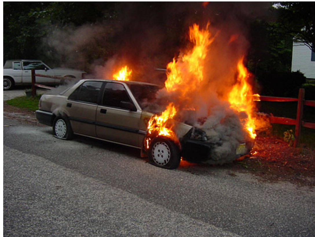
Car fire, unidentified, 6/24/2004