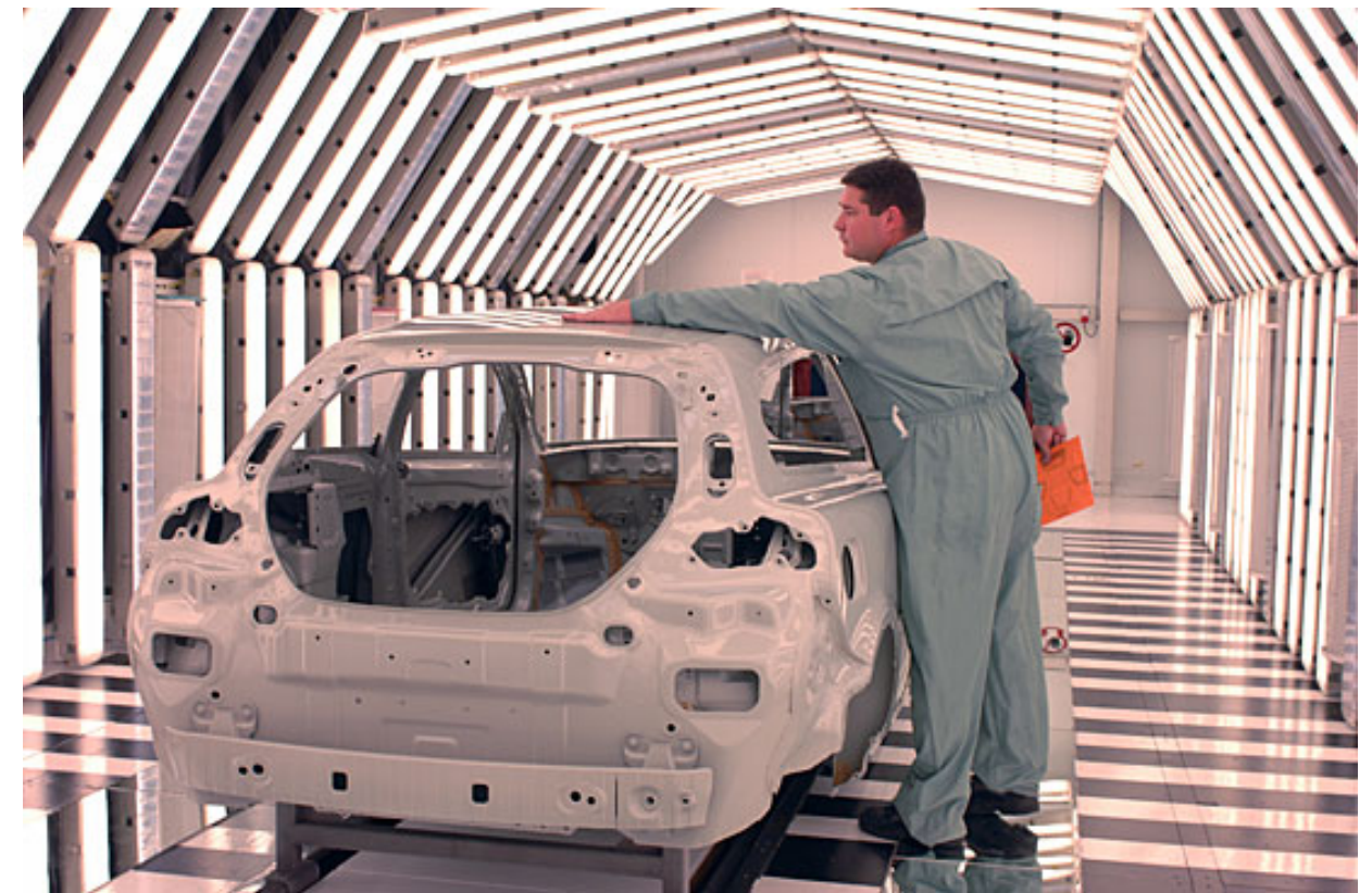
Production/manufacturing of the Volvo C30 at the Volvo Cars plant in Ghent, 2006.

I have worked on the “Volvo question” for the last few years. Most of my research on Volvo has been done through Brazilian academic papers concerning the legacy of 1970s production techniques in Scandinavia and models of flexibility, collaboration, and the idea of a better working environment in an ideally productive post-Fordist context. There has been