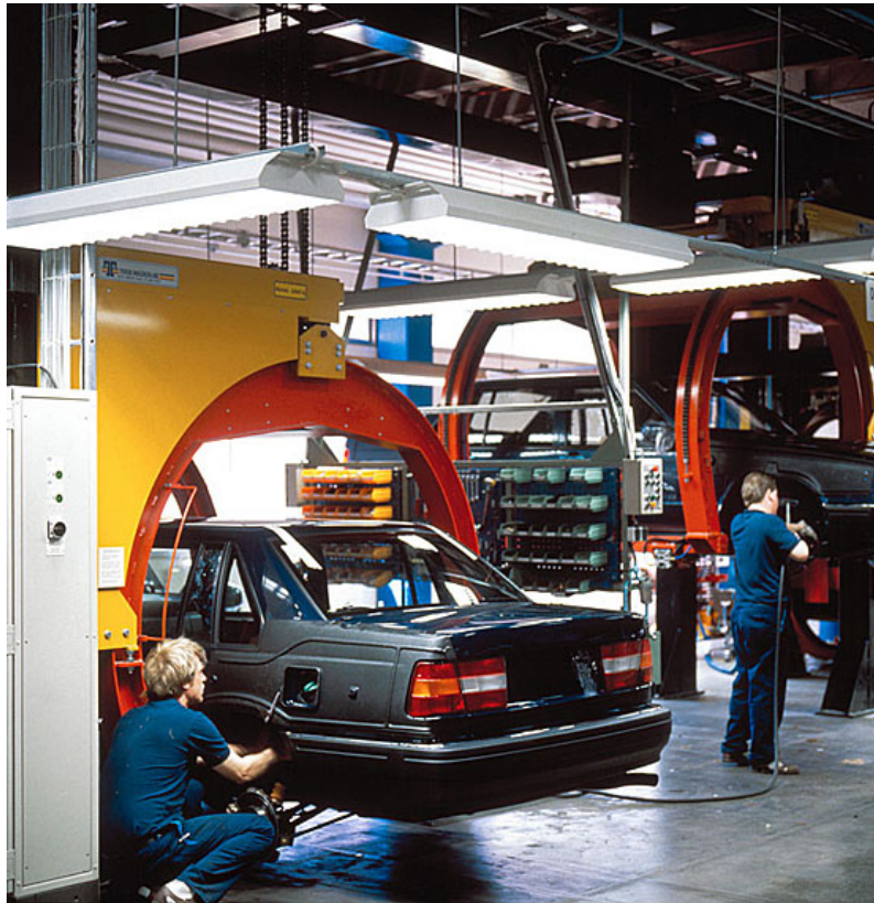
Production in the Kalmar plant, which produced cars for Volvo between 1974 to 1994.