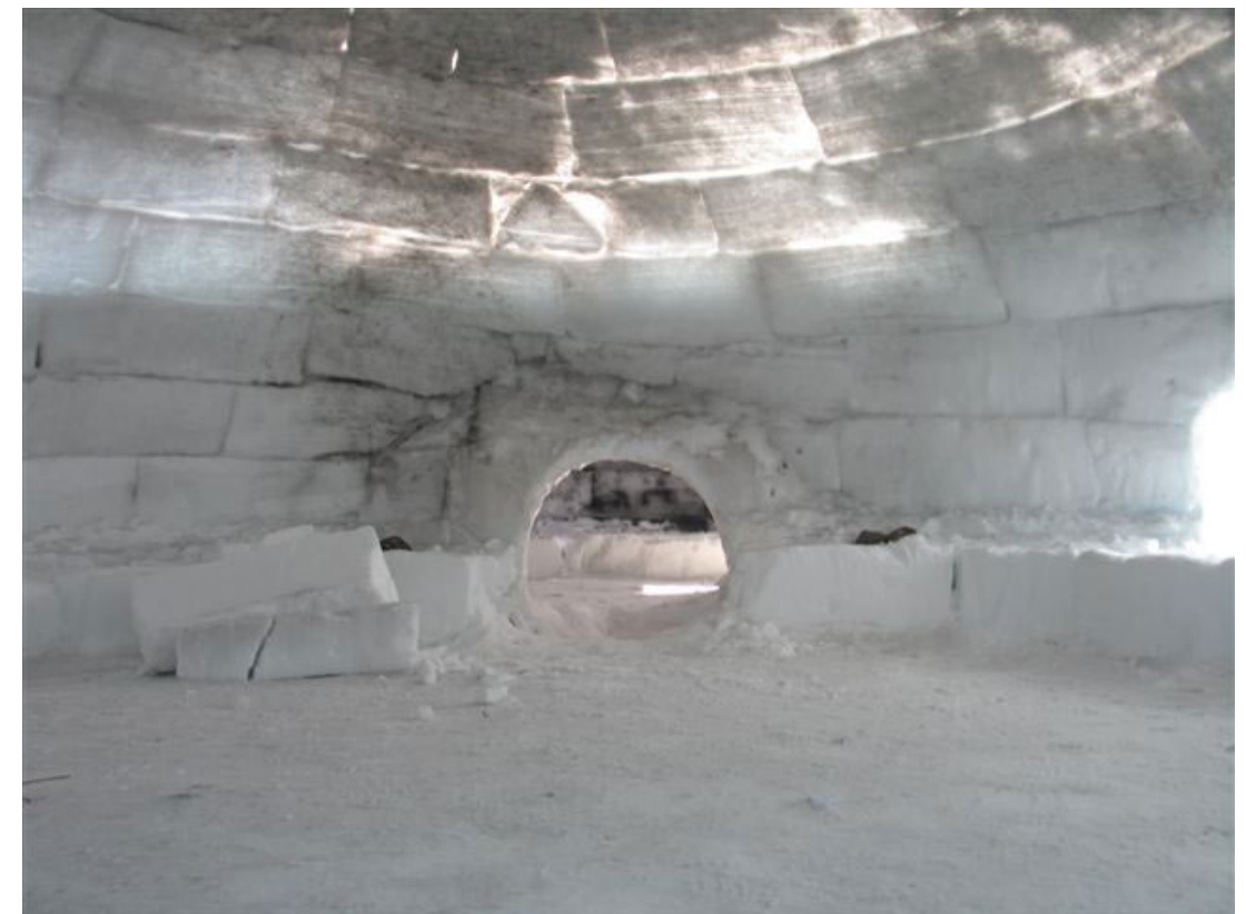
Installation White Cube, London.