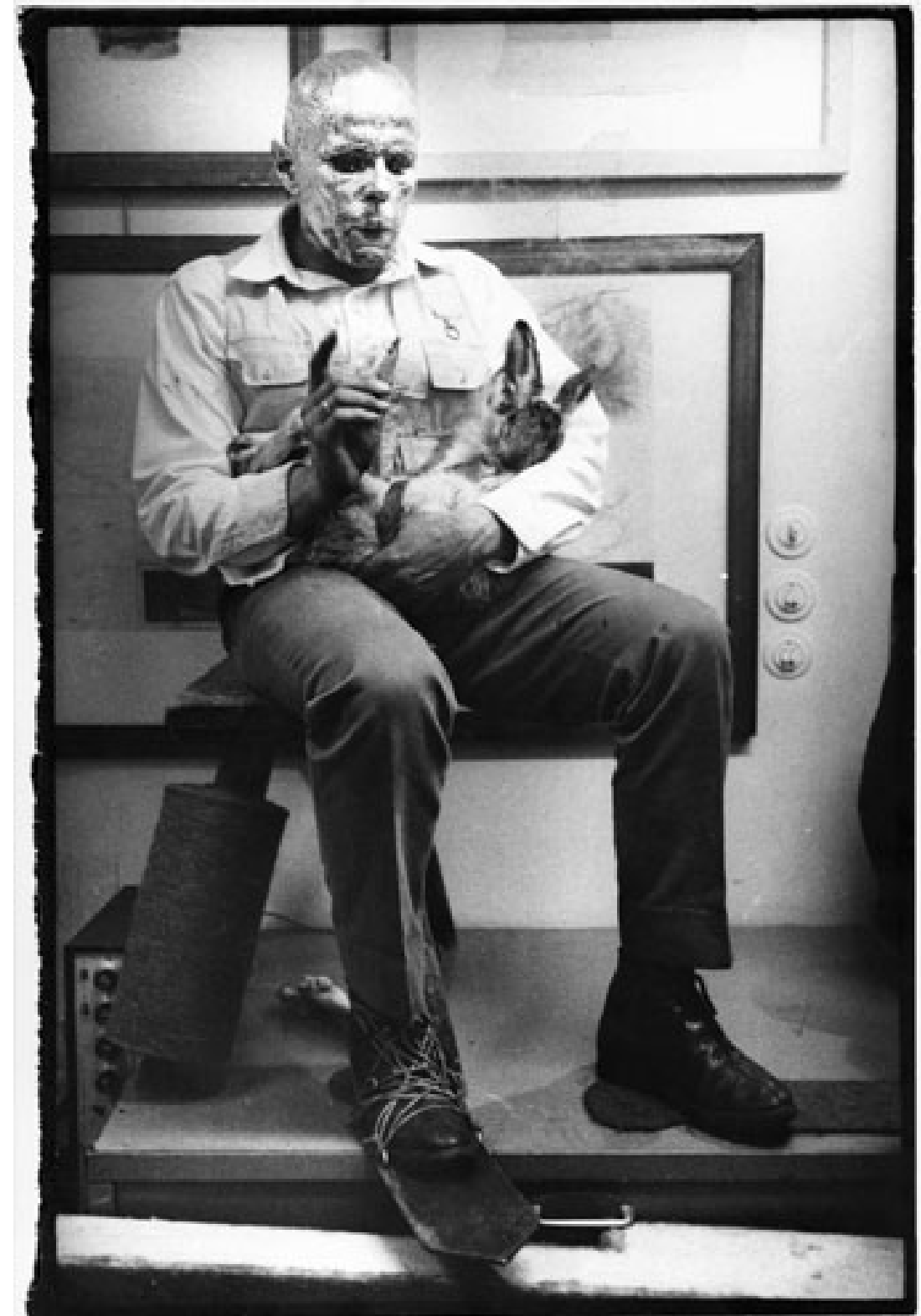
Joseph Beuys, How to Explain Pictures to a Dead Hare (26 November 1965), performance documentation at Galerie Alfred Schmela, Düsseldorf.