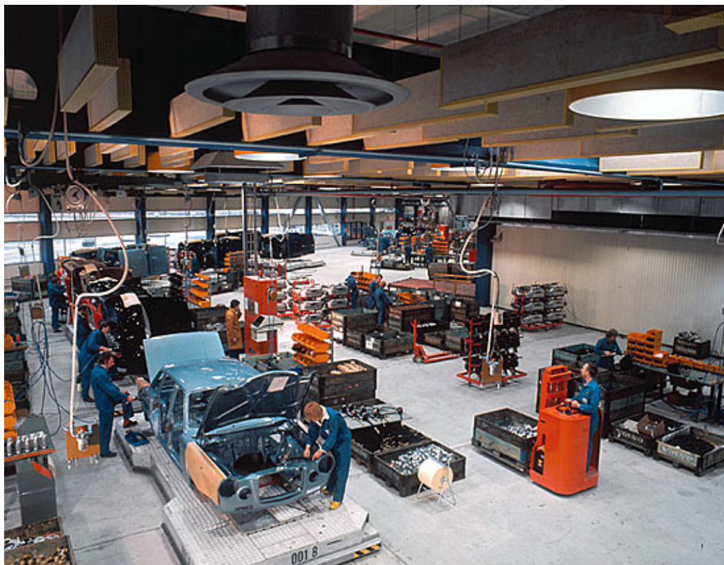
Production in the Kalmar plant, which produced cars for Volvo between 1974 to 1994.