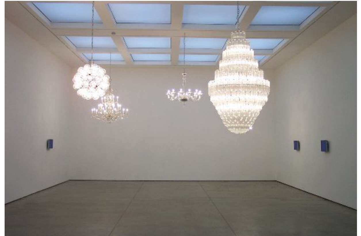
Cerith Wyn Evans, Look at that picture... How does it appear to you now? Does it seem to be Persisting? , 2003.