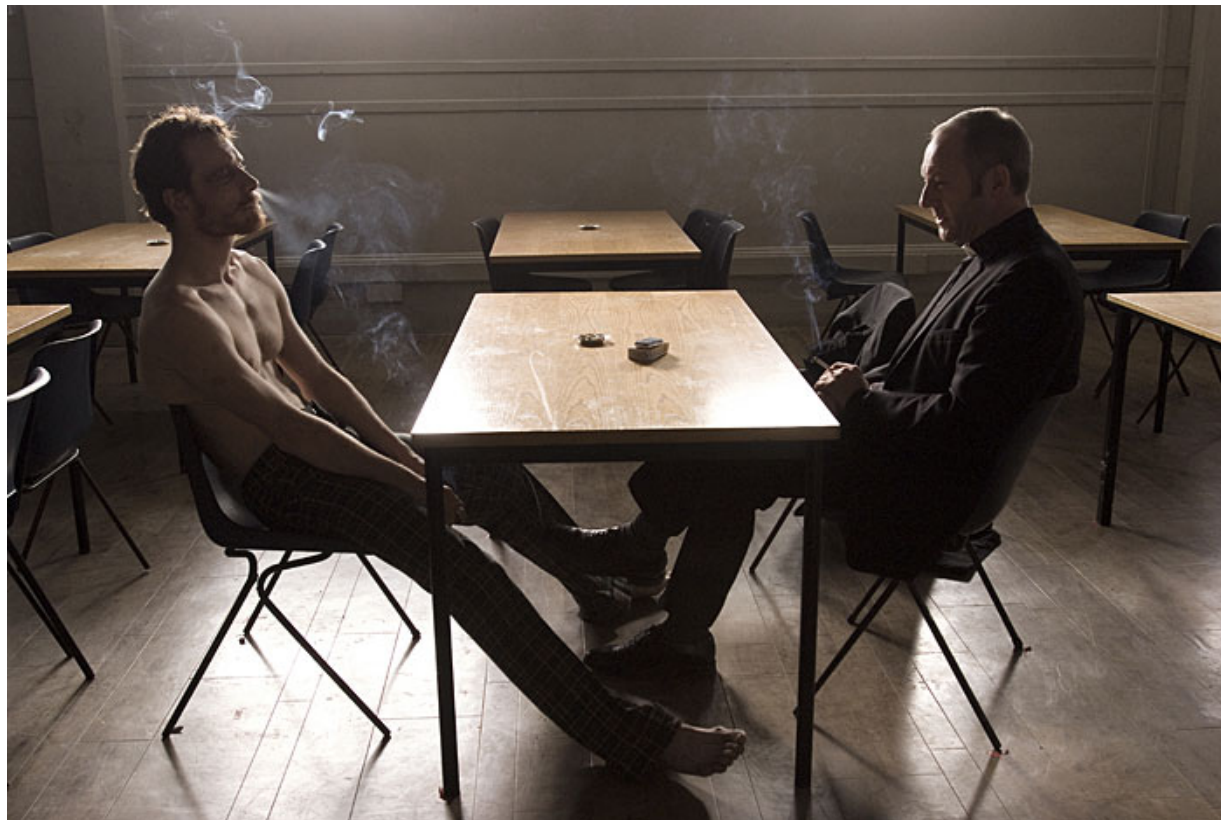
Still from Hunger (2008), 96 min. Directed by Steve McQueen

A real education for an artist consists of preparation for a pure research of the unknown. In a strong art education, this starts at the very beginning. But as institutional education in other areas is organized to convey only known information and to perpetuate conventional habits, these are two pedagogies in fundamental conflict. Where, then, should the fight against illiteracy be placed? Should alphabetization be