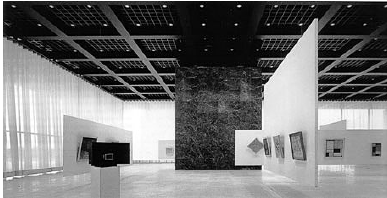
Neue Nationalgalerie, Berlin