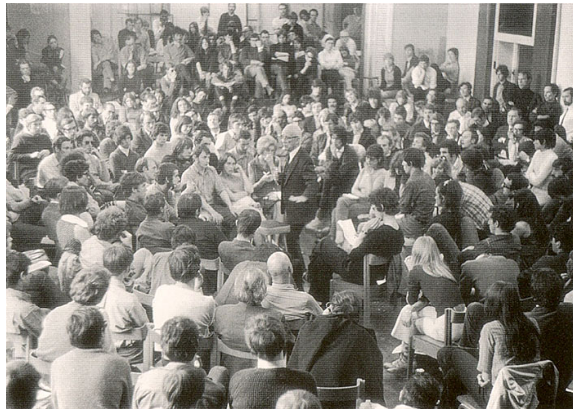
Buckminster Fuller speaking at Hornsey College of Art, June 29, 1968.

notion of the sovereign individual and life beyond utility that Michael Taussig described in Defacement: Public Secrecy and the Labor of the Negative . The sovereign in this sense is the hysteric, the defacer, the masked revolutionary who is questioning the name of the event: “why is this the name of the event and not something else?” As a response to received notions of reality and truth, the hysteric defamiliarizes those notions by repeatedly questioning the name of the event – by not accepting the naturalized rule of the things that are put into place and that appear to be the only way to do things. Defacement of the given names of events deconstructs representations of power and takes them to a domain of life beyond utility.