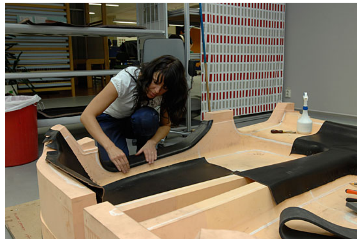
At work on the Volvo production floor lining the XC60 concept car in dark-brown saddle-quality leather.