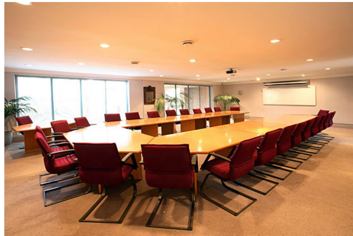
Board Room at the African Leadership Academy