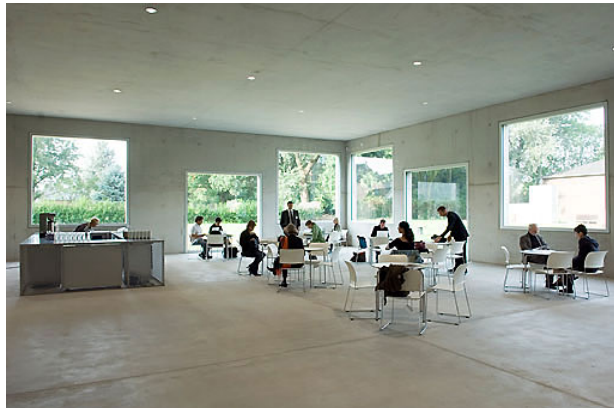
The museum cafe.

Few essays have garnered as much immediate response as Brian O’Doherty’s “Inside the White Cube,” originally published as a series of three articles in Artforum in 1976, and subsequently collected in a book of the same name. 1 According to myth, the issues of Artforum containing O’Doherty’s texts sold out very quickly, and as he himself has remarked, many artists he spoke to at the time told him that they themselves had been thinking about writing something similar. This is to say that the main concern of the essay – how to deal with the white cube convention for gallery design – was shared by many of his contemporaries. Naturally, O’Doherty was writing not only within the specific context of post-minimalism and conceptual art of the 1970s, but also from the point of view of artistic practice. Aside from being a prominent critic, O’Doherty was also an installation artist, having worked since 1972 under the name of Patrick Ireland (in protest against the British Army’s involvement in Ulster). As both theorist and practitioner, insider and outsider, he was not in a bad position to examine the ideology of something as peculiar as the modern gallery space, the much loved and maligned “white cube.”