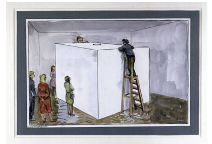
Ilya Kabakov, The White Cube , 2005. Watercolor and pencil, 40.5 x 29.5 cm

In many ways, O’Doherty’s point is as simple as it is radical: the gallery space is not a neutral container, but a historical construct. Furthermore, it is an aesthetic object in and of itself. The ideal form of the white cube that modernism developed for the gallery space is inseparable from the artworks exhibited inside it. Indeed, the white cube not only conditions, but also overpowers the artworks themselves in its shift from placing content within a context to making the context itself the content. However, this emergence of context is enabled primarily through its attempted disappearance. The white