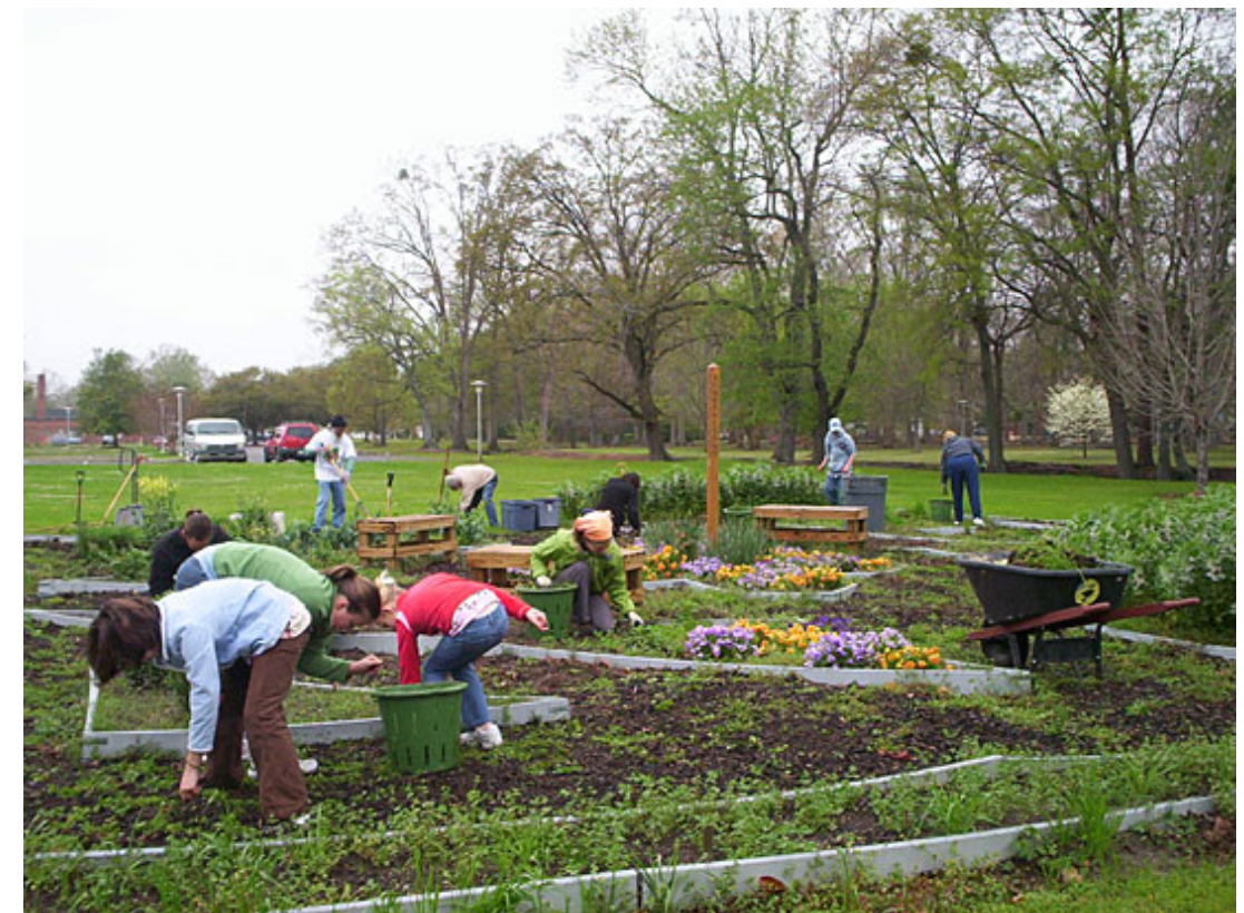
Wayne County Public Library Community Peace Garden