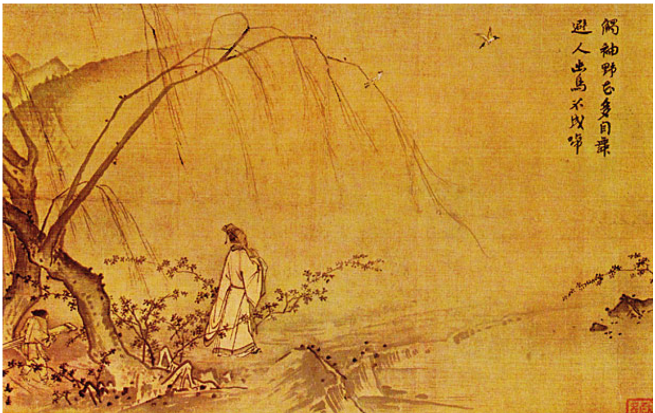
Ma Yuan (active 1190-1225), On a Mountain Path in Spring , Ink and color on silk. Southern Sung.

However, at the turn of the twenty-first century, art entered a new era – one of mass artistic production, and not only mass art consumption. To make a video and put it on display via the Internet became an easy operation, accessible to almost everyone. The practice of self-documentation has today become a mass practice and even a mass obsession. Contemporary means of communications and networks like Facebook, YouTube, Second Life, and Twitter give global populations the possibility to present their photos, videos, and texts in a way that cannot be distinguished from any post-Conceptual artwork, including time-based artworks. And that means that contemporary art has today become a mass-cultural practice. So the question arises: How can a contemporary artist survive this popular success of contemporary art? Or, how can the artist survive in a world in which everyone can, after all, become an artist? In order to make visible himself or herself in the contemporary context of mass artistic