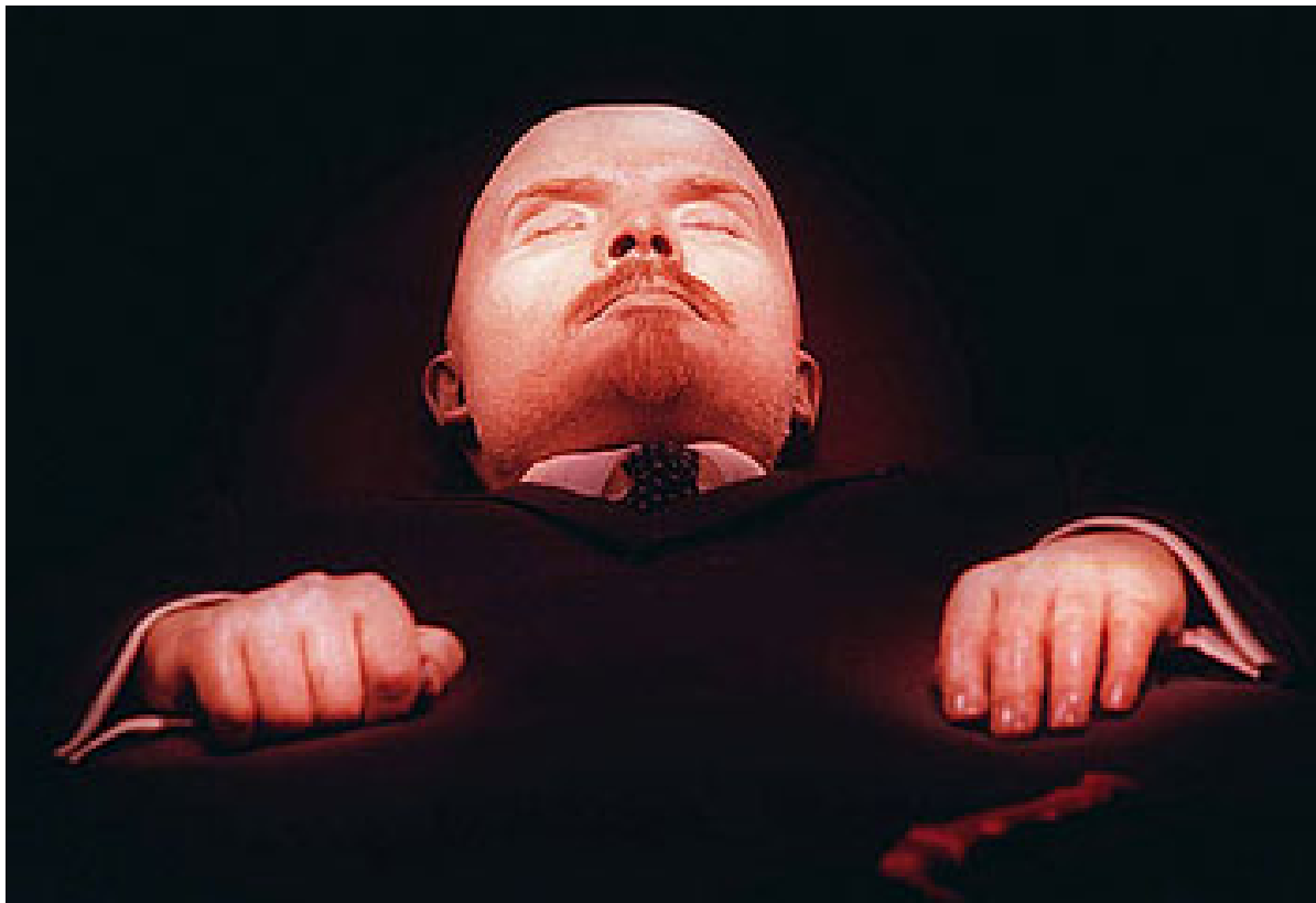
Lenin's embalmed/mummified body, permanently exhibited in the Lenin Mausoleum, Moscow, since 1924.