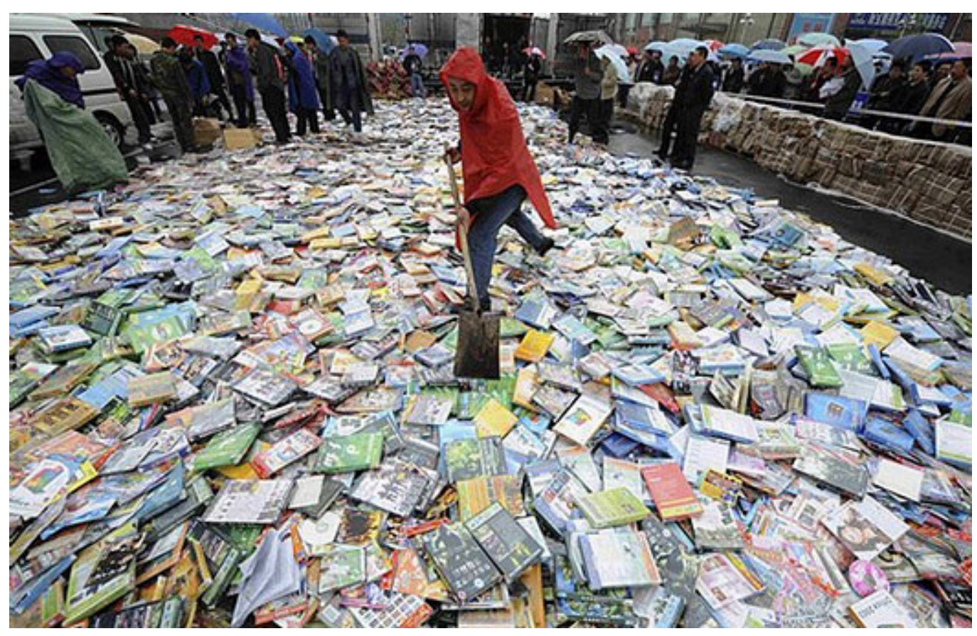
Shoveling pirated DVDs in Taiyuan, Shanxi province, China, April 20, 2008.