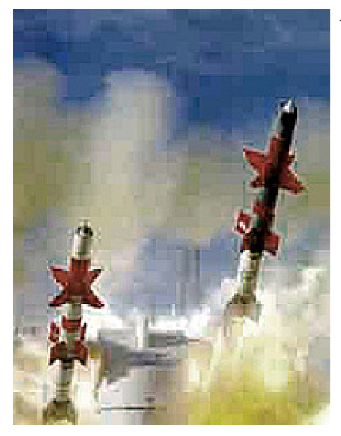
Thomas Ruff, jpeg rl104, 2007.

But, simultaneously, a paradoxical reversal happens. The circulation of poor images creates a circuit, which fulfills the original ambitions of militant and (some) essayistic and experimental cinema – to create an alternative economy of images, an imperfect cinema existing inside as well as beyond and under commercial media streams. In the age of file-sharing, even marginalized content circulates again and reconnects dispersed worldwide audiences.