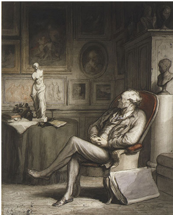
Honoré Daumier, The Connoisseur (1860–1865). Pen and ink, wash, watercolor, lithographic crayon, and gouache over black chalk on wove paper.