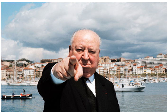
Alfred Hitchcock poses on a boat in Cannes, May 1972.

In its day, Duchamp's Fountain remained a novelty, if not an outrage. Its influence would not be truly ascendant until the 1960s, when rising Pop and Conceptual artists discovered in the "ready-made" a legitimating tradition. And it is yet another historical irony that, just as industrial materials were entering into the mainstream of fine art, the conventions of fine art were accumulating around the quintessential industrialized art: Hollywood film. 34 Directed at a mass audience and subject to Taylorized production procedures, individual authorship was so little important to Hollywood's Golden Age (roughly the Twenties to the Forties) that the term "the genius of the System" has come into currency to indicate how the corporation itself, the Studio, fulfilled the role of artist. 35