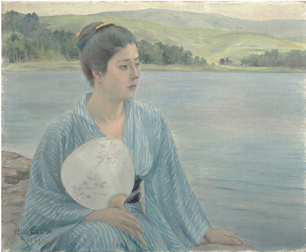
Kuroda Seiki, □□ [Lakeside] (1897). Oil on canvas. 69 × 84.7 cm.