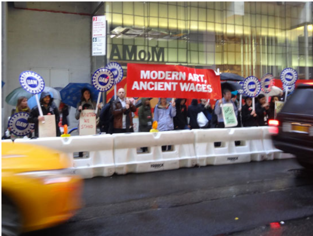
Museum of Modern Art staff protests Healthcare cuts outside of a fundraising event.

The main disappointment is still the breach of the commitment that was promised. Artists were told that Daros acquired works for