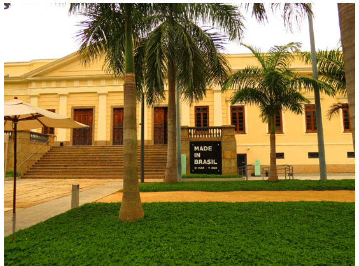
Casa Daros announced it was closing in 2015 after only two years of operation in Rio de Janeiro.

The official announcement that Casa Daros, the cultural institution of the Daros Latin America Collection, is closing in Rio de Janeiro as of December 2015 came as a big surprise to Latin American cultural circles. The ambitious project insofar as it concerned exhibitions only lasted two years. The argument invoked in a press conference is a lack of financial means to keep the project running. After an investment of sixteen million reais in 2006 (roughly $8 million USD) to buy the building, and then sixty-seven million reais (roughly $21.5 million USD) to restore it, one would presume that somebody would have run through the budget for sustaining such an ambitious project. 1 The loss for Latin American culture is grave, because Casa Daros promised to be a continental cultural center that would transcend Latin America's nationalist fragmentation and become an international reference point. There are many reasons why I'm sorry about the disappearance of Casa Daros, 2 but here I'm interested in understanding its loss as a cultural symptom and how this symptom connects with general issues concerning the fickleness of philanthropic institutions. The more modest plan now is to circulate and lend works from its 1200-piece collection to other venues. The Daros Collection stands out among its peers because it assembled whole bodies of work by artists, rather than single representative examples.