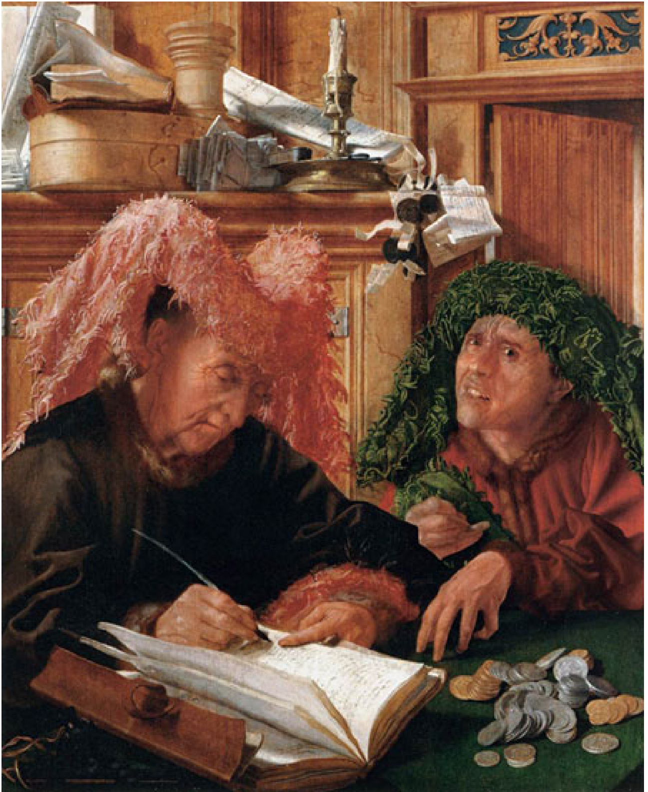
Marinus van Reyerswaele, The Tax Collectors , c. 1540. Oil on panel, 94 x 77 cm.