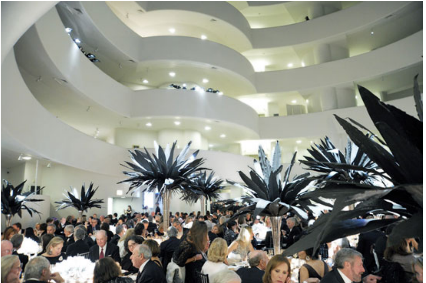
Diners eat in the Ronald O. Perelman Rotunda during the 2012 Guggenheim Gala.