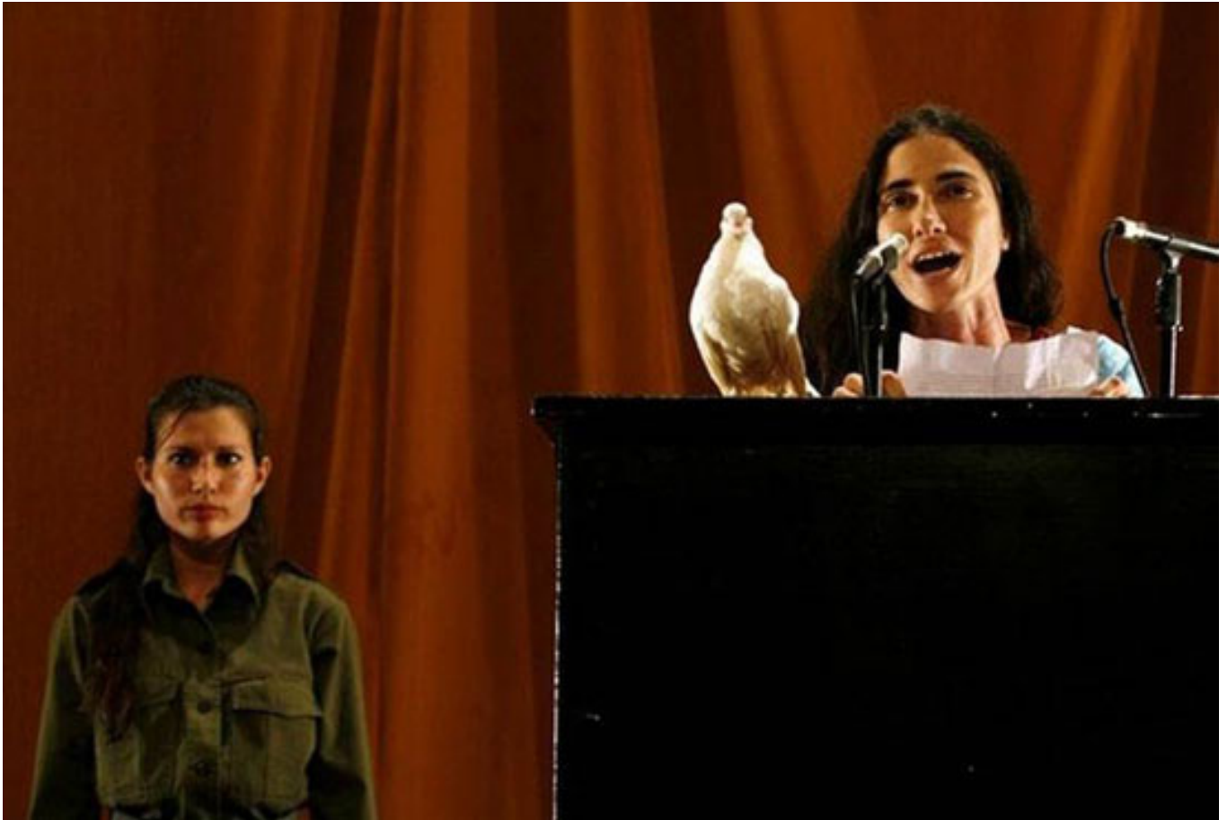
Tania Bruguera, Tatlin's Whisper #6 (Havana version), 2009. HD video, 40:30 minutes. Documentation of the performance at the Tenth Havana Biennial, Central Patio of the Wifredo Lam Contemporary Art Center, Havana, Cuba. Blogger Yoani Sanchez (right) gives a one-minute speech within the performance.