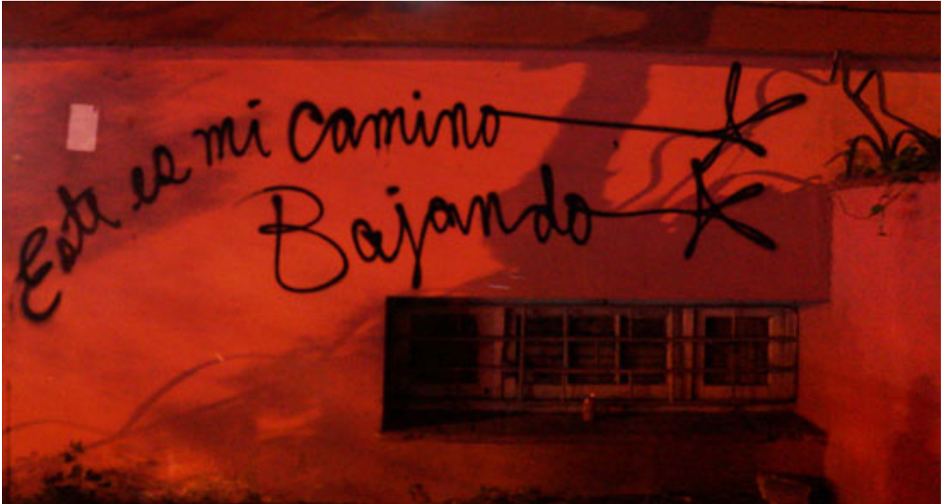
Graffiti by Cuban artist El Sexto, who was arrested on December 24, 2014 on his way to a performance in Parque Central, Havana.