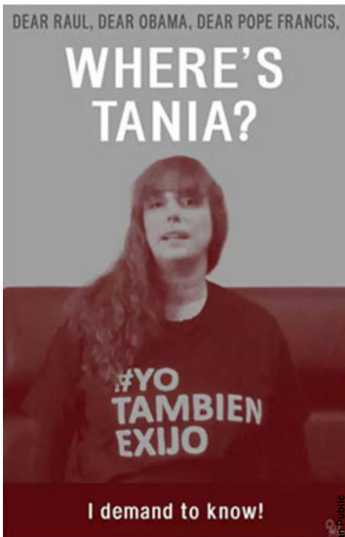
This poster alerts various official figures to Tania Bruguera's recent detention by the Cuban police.