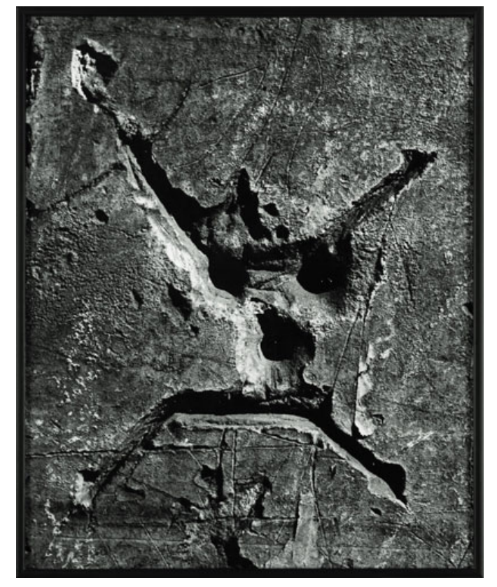
Brassaï, Untitled from the Series II "La mort," 1930. Gelatin silver print. Collection MACBA, Barcelona.

But since the content of humanity is distinguished by its capacity to engage rational