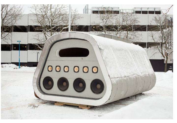
Learning Site (Rikke Luther and Cecilia Wendt with Jaime Stapleton), Audible Dwelling, 0.2, 2013.

Are models necessary? Social models usually have a mimetic relation to a given reality, and they start with the whole, not the part. What if we check our desire to project figurative qualities onto the future and desist from producing models that may improve society as it exists? What would it mean to engage in historical processes and social struggles, but proceed without a specific model or image of the society to come? How can we take a cubistic approach, dispensing with the falseness of the whole?