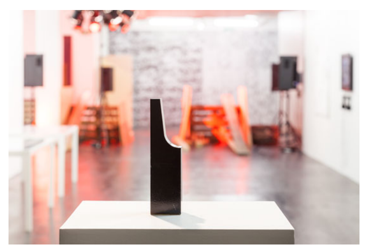
Xabier Salaberria, Martello (The Model) , 2013. Machined brass and synthetic paint.