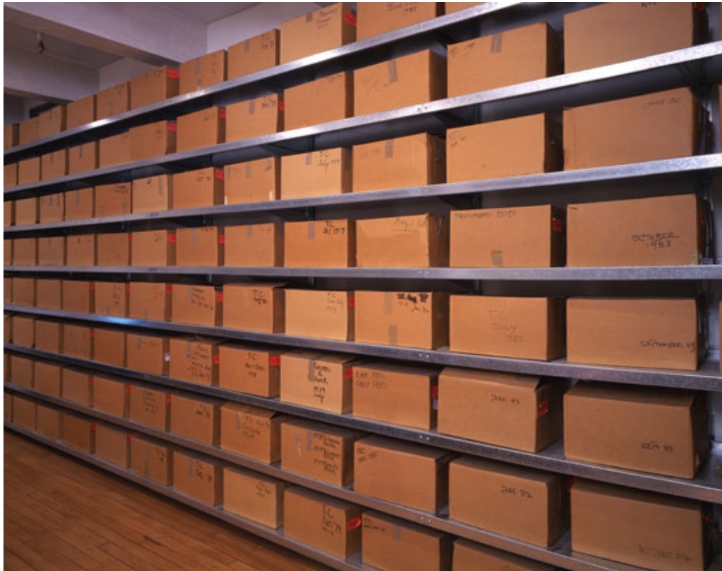
A hundred of Andy Warhol's 610 Time Capsules shelved.