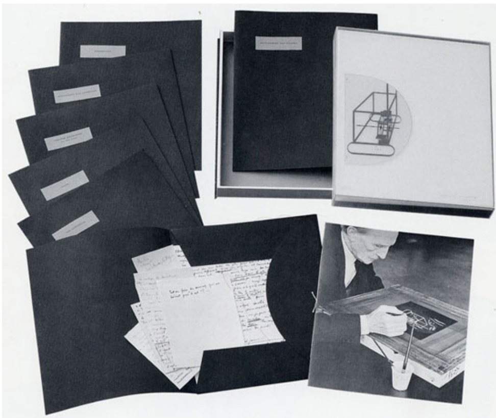
Image from catalog Marcel Duchamp Graphics , Kyoto Shoin, 1991.