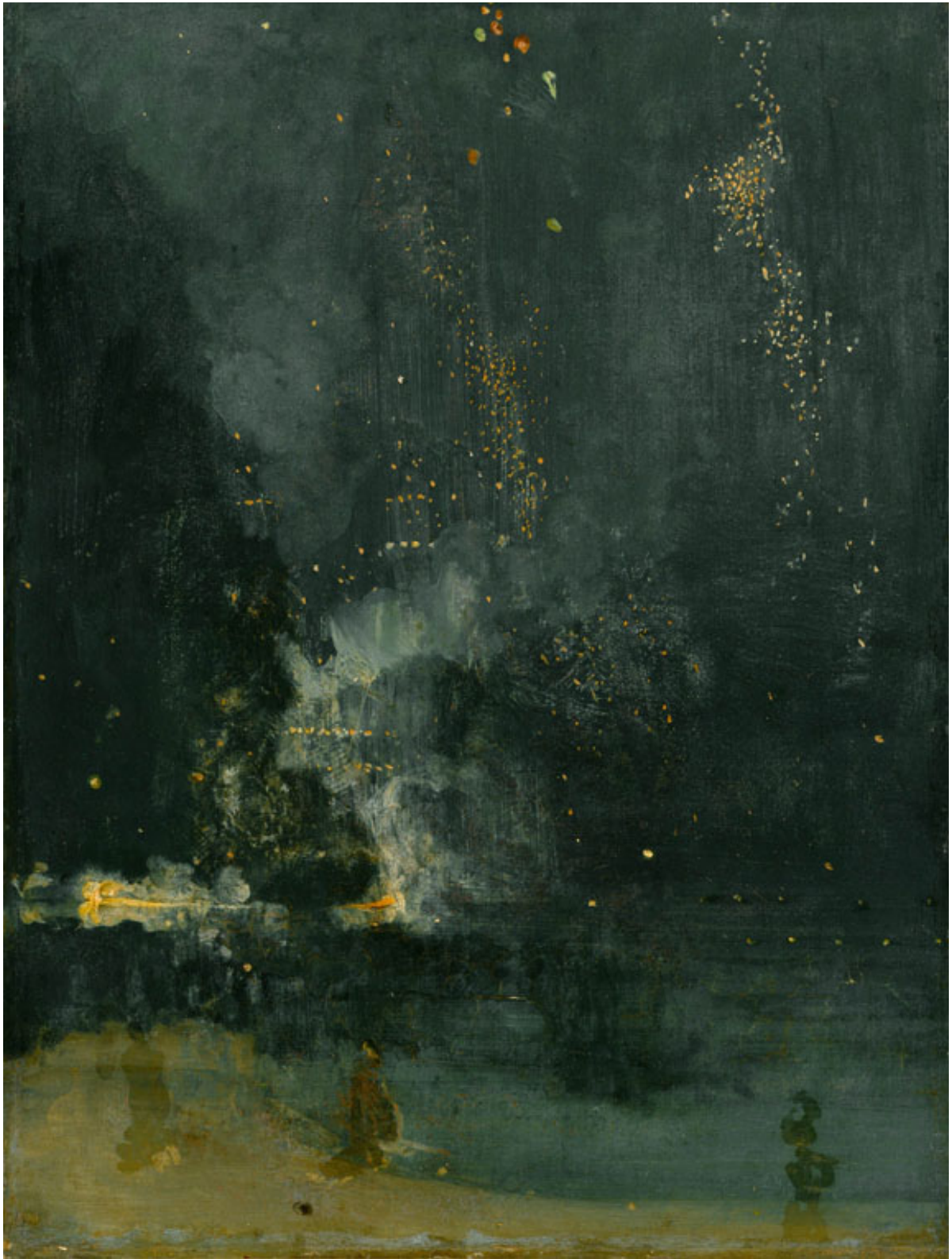
James Abbott McNeill Whistler, Nocturne in Black and Gold (The Falling Rocket) , circa 1875. Oil on panel. Detroit Institute of Art.