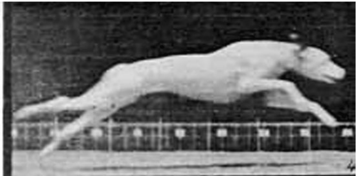
Animated sequence of a dog galloping. Photos by Eadweard Muybridge, first published in the book by the same author Animal Locomotion (1887).

During his student days in Florence in the late 1880s, Warburg read Darwin extensively, as well as Vignoli. Among his lengthy notes on Darwin’s The Expression of Emotions in Men and Animals there is one page on “dogs” ( Hunde ).