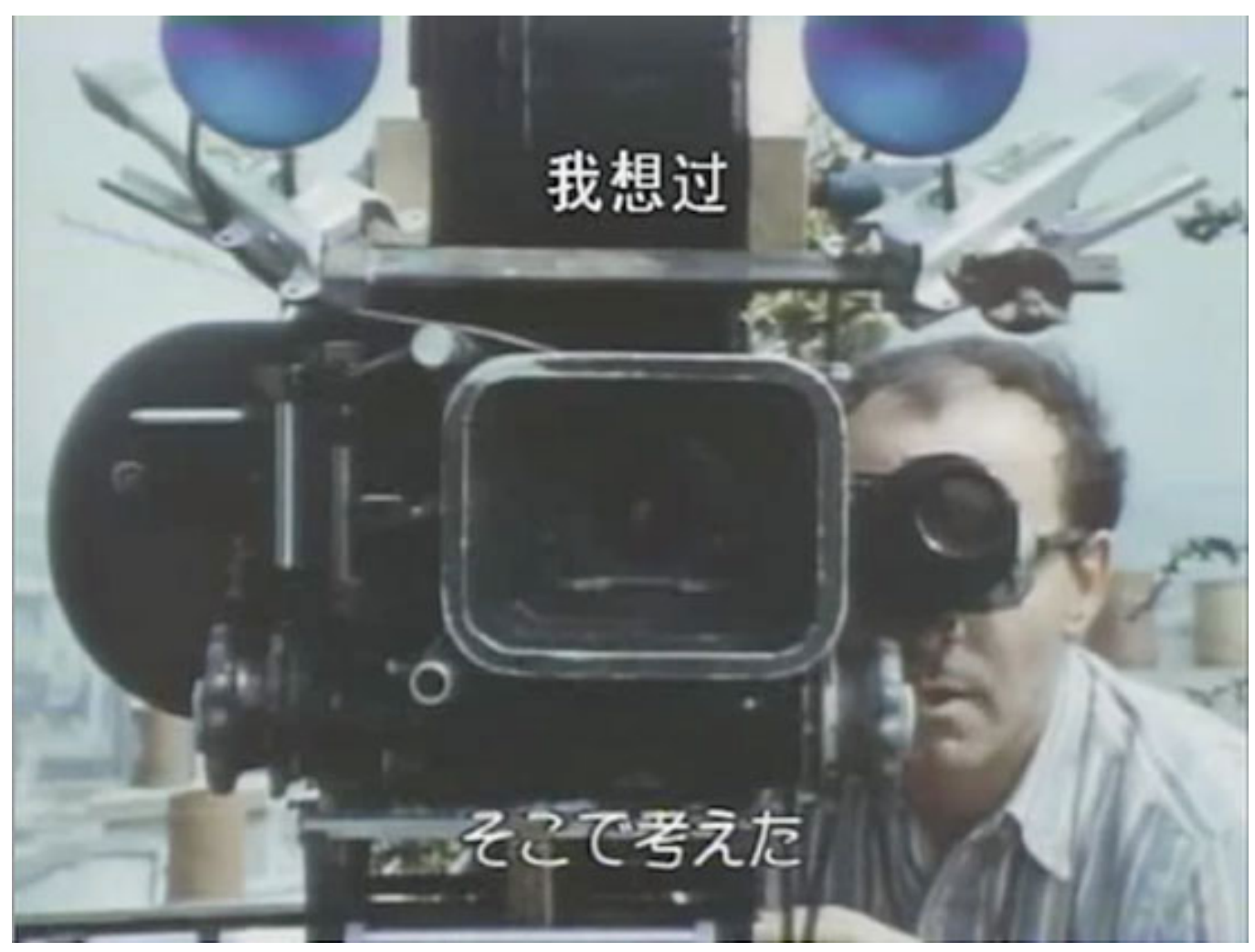
Still from "Camera Eye" in Jean-Luc Godard, Far from Vietnam, 1967.