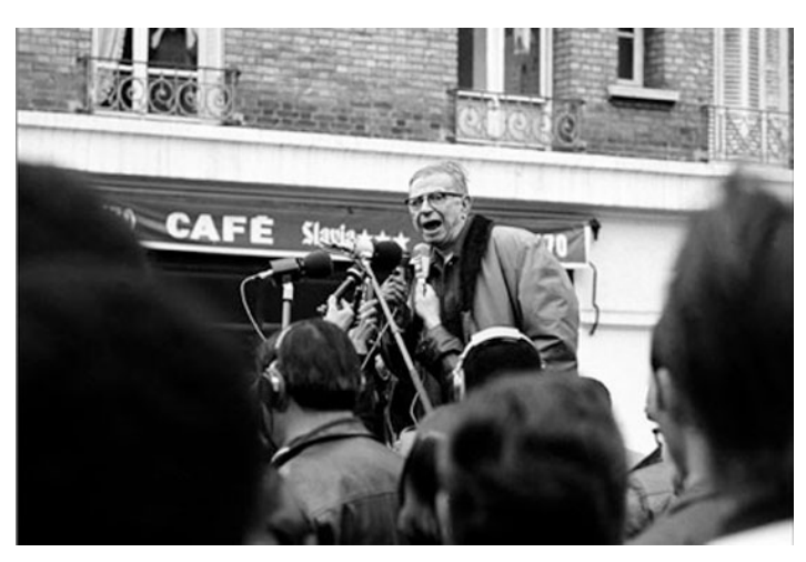
Sartre speaking out.

Figures like Breton and Sartre are inseparable from the history and tradition of the French avant-garde, which I consider here in light of the relationship between French intellectuals and the French Communist Party (PCF). Modeled after Lenin's vanguard party, the PCF bestowed a pivotal role on intellectuals between the end of World War II and 1965: the production and transmission of political knowledge to the proletariat. As described in What Is To Be Done?, Lenin's Party functioned as the vanguard of the proletariat, a highly centralized body organized around a core of experienced intellectuals designated as "professional revolutionaries" who were charged with leading the social democratic revolution.<sup>2</sup> This ideological avant-garde operated in the realm of opinion and leftist common sense, putting art in the service of political causes and taking for granted the artist's position as the porte parole of humanity. Such an avant-garde posits a transitive relationship between art and politics – that is, a causal relationship between the two, even the instrumentalization of art in the name of leftist political ideology.