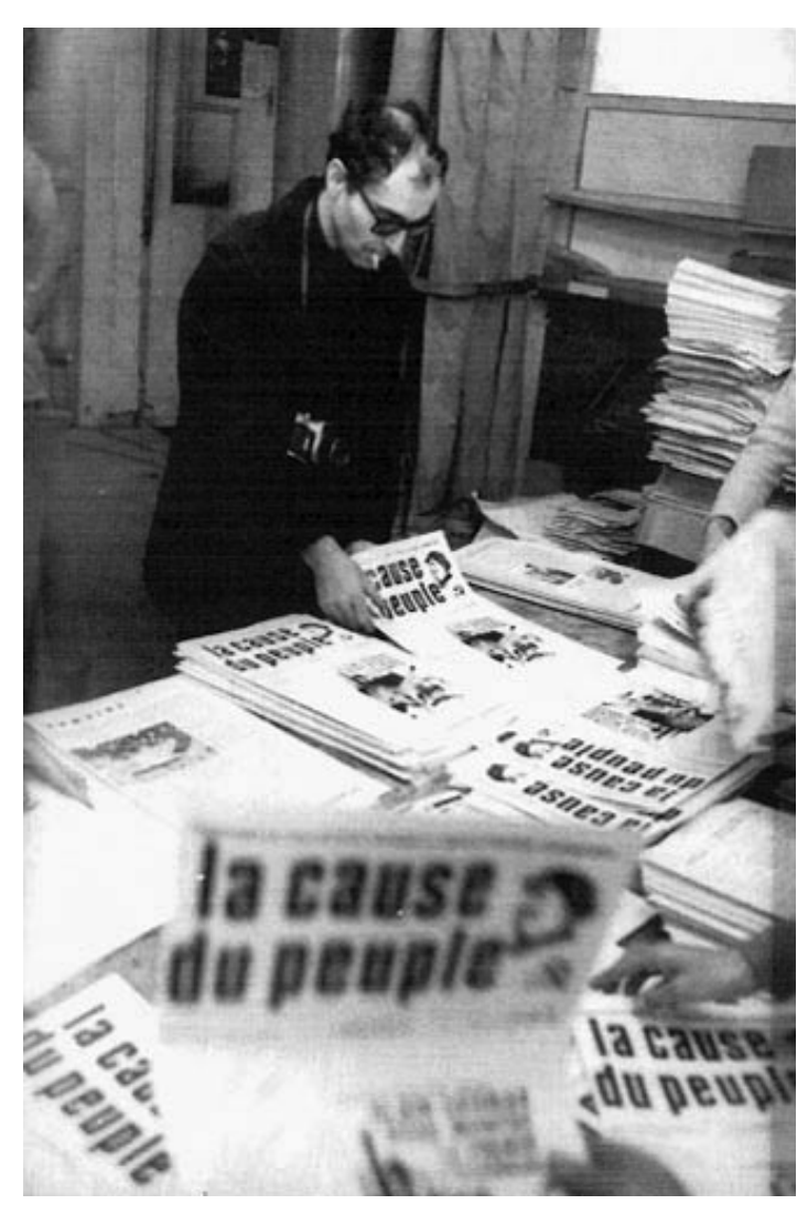
Godard at the printshop of La Cause du Peuple, 1970.

politics? Such a position would imply a causal link between aesthetics and politics: if political freedom, then aesthetic liberation. By contrast, the position of objective denunciation entails that aesthetic activity be intrinsically linked to political action as the means to achieve or announce the emancipation of humanity. As we will see, Godard's position is more complex, as it was not only in dialogue with the vanguardist tradition, but he also entered into dialogue with Jean-Paul Sartre.