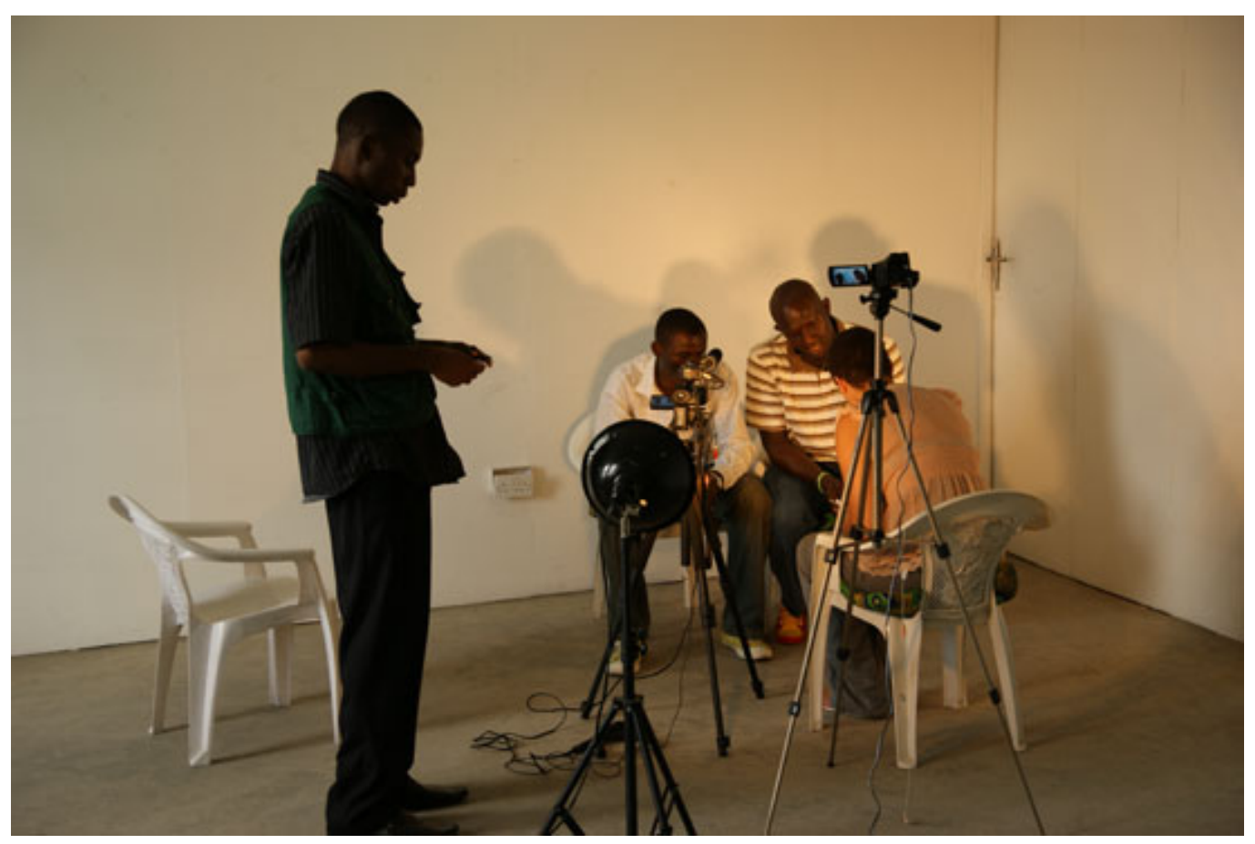
Preparing an interview session with NSK passport applicants at CCA Lagos.