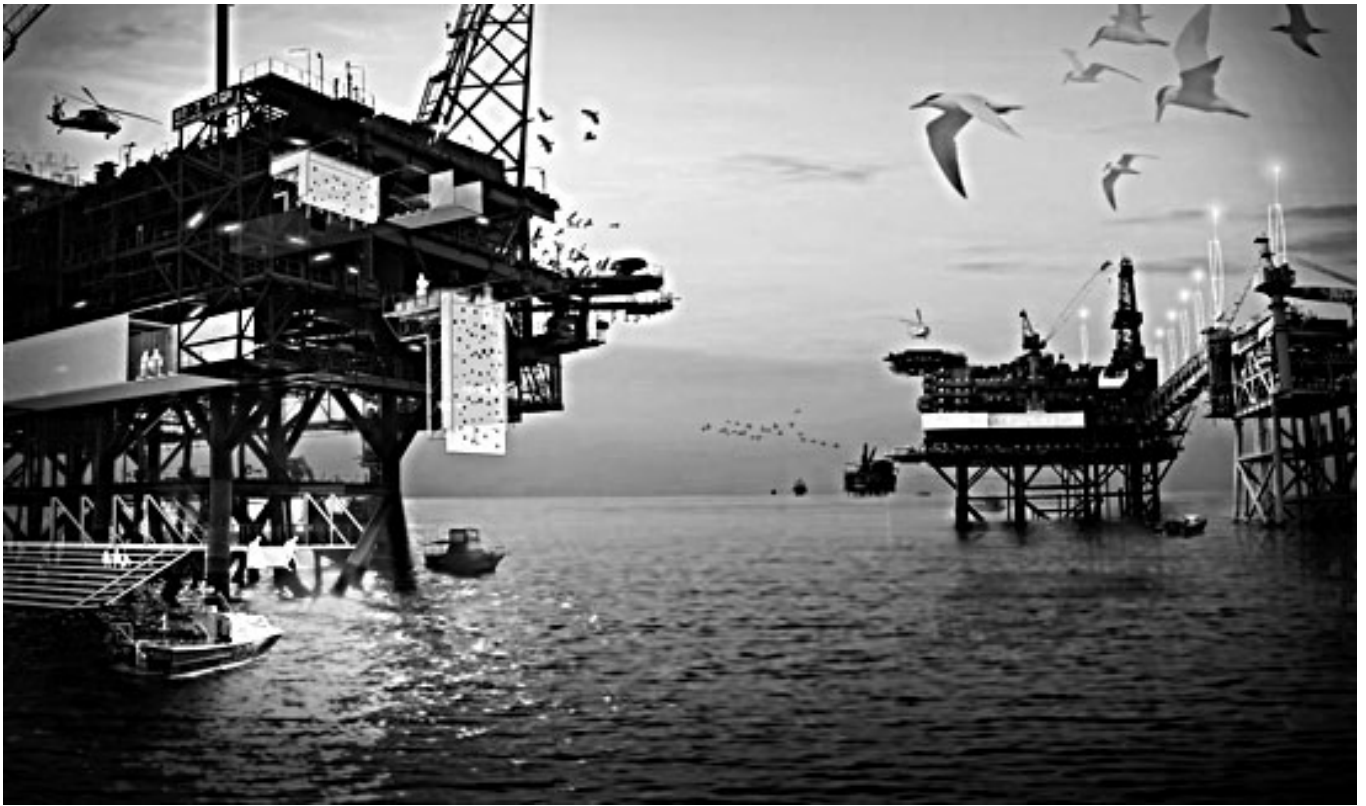
InfraNet Lab/Lateral Office, Re-Rigging , 2010. Project for a multifunctional off shore oil platform in the Caspian Sea, ready to be readapted “beyond that moment when the last barrel of oil leaves the sea bed.”