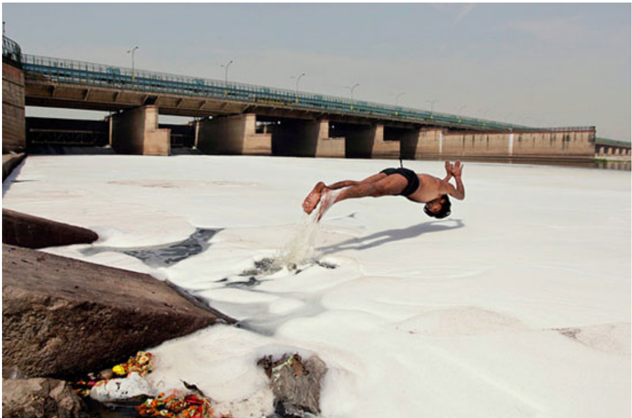
Man diving into the polluted Yamuna river, northern India.

Surely this is what someone like Nick Land has in mind when he proposes that “the history of capitalism is an invasion from the future by an artificial intelligent space that must assemble itself entirely from the enemy’s resources.” 7 It feeds on what it finds, leaving behind a metaphorical grey chemical sludge. This alien intelligence from the future seems committed to bringing about an ultimate inorganic state, the apocalypse of that final drag of everything into the post-biological, and it is working incrementally as it moves forward through history in order to realize the future it left “behind.” Like a swarm of replibots run amok, capitalism feeds on this world in order to swell itself, but maybe not to swell into anything more