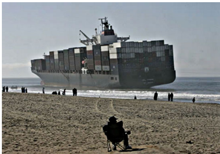
Panamax ship adrift.

and maximize profit. The Panama Canal became one of the key transit points for shipping when it was completed in 1914. Originally, all sizes and shapes of ships passed through it, with the only constraint being that the ship should not exceed the width, depth, and buoyancy conditions of the canal. But, over time, in an effort to maximize profit, companies designed what came to be called a Panamax ship: transport vessels that occupied every meter of the canal's lock system and container boxes that could be stacked tightly side-by-side.