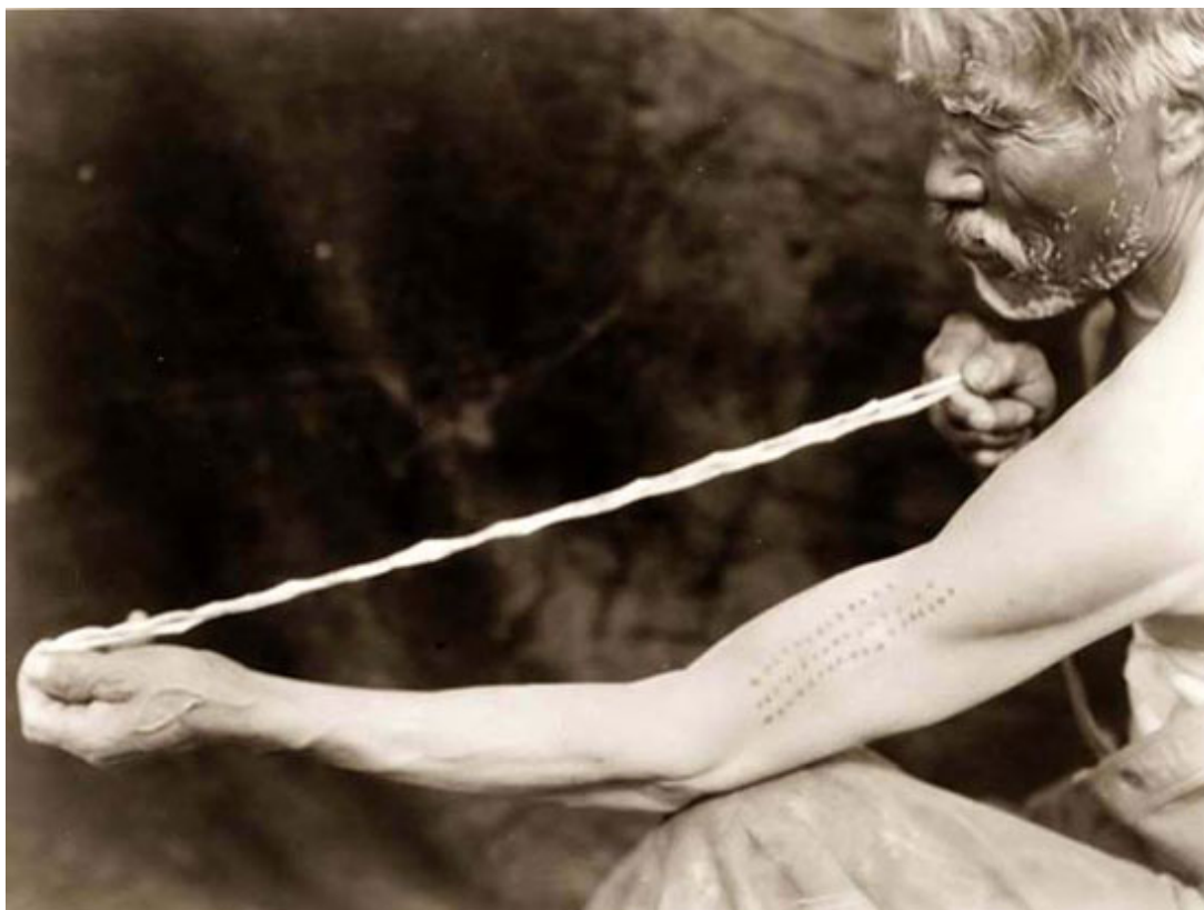
Edward S. Curtis, Tolowa Indian Measuring shell money , 1868-1952.

The understanding of “gift economies” as a vital part of the machinery of social power was essential to Marcel Mauss’s reinterpretation of Malinowski’s account of Kula and other ethnographies of the Pacific in The Gift . For