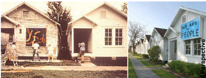
Project Row Houses, before, during and after renovation.

The artist Tania Bruguera has said that it is time to put Duchamp's urinal back in the bathroom. That is to say that bringing life into art can no longer be considered an important gesture. Rather, life should be viewed from the epistemological vantage point found in some contemporary art. If one is interested in a more ambitious and meaningful project, perhaps it isn't enough to depend on the niche market that is art. As accelerated time comes to characterize not only survival in the arts, but also the default condition of the public, we find forms of meaning that resist the tide of capital and gravitate toward not only the long term, but also the profoundly civic.