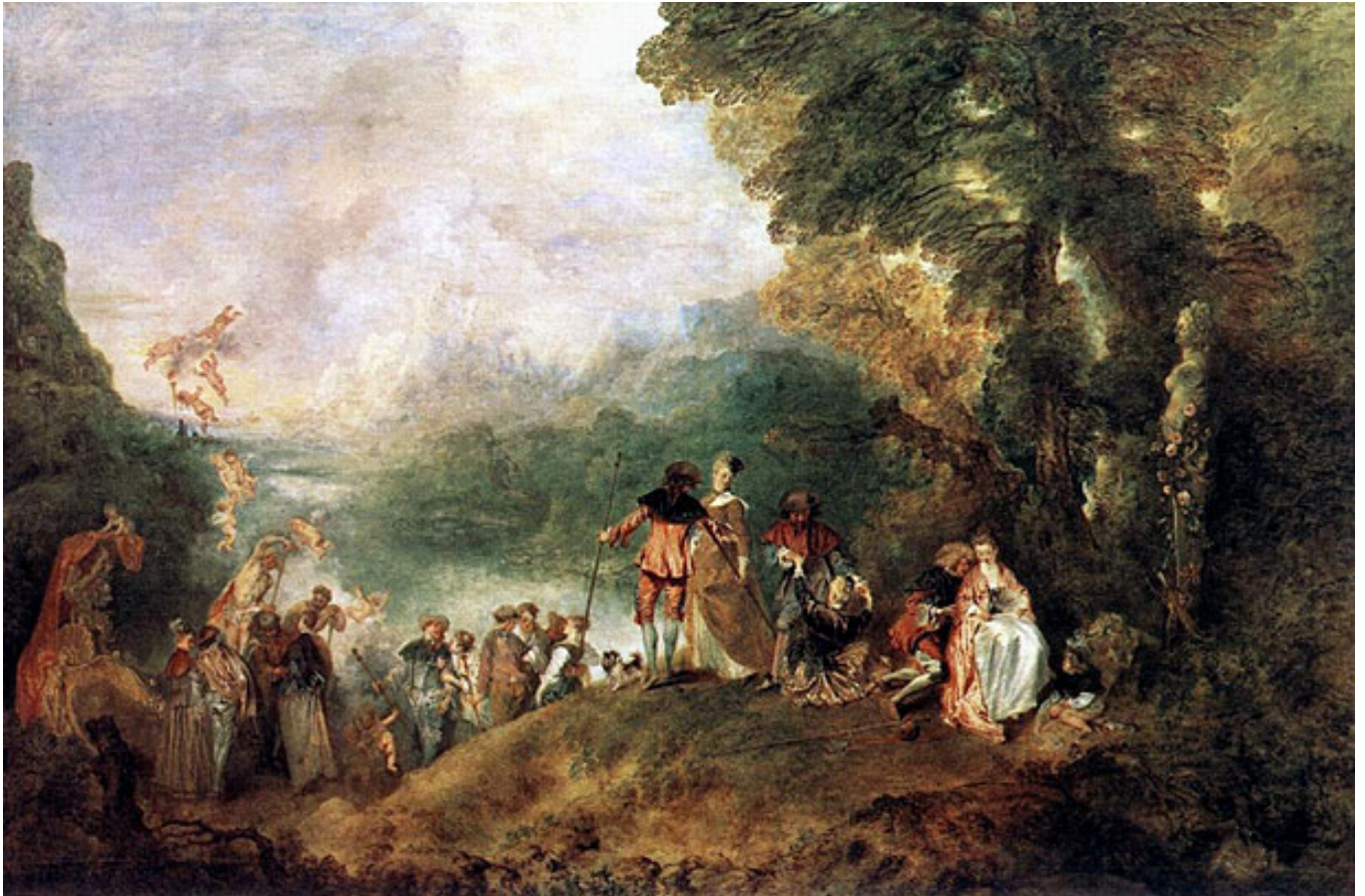
Antoine Watteau, Le Pèlerinage à l'île de Cithère [ The Pilgrimage to the Island of Cythera ], 1717.