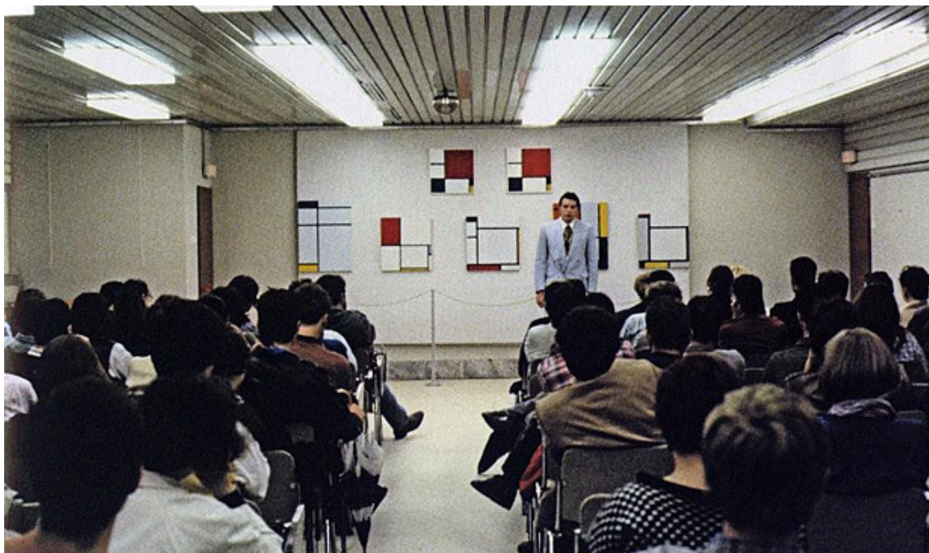
Walter Benjamin, Mondrian '63-'96, lecture held in Cankarjev dom and organized by Gallery ŠKUC, Ljubljana, 1986.