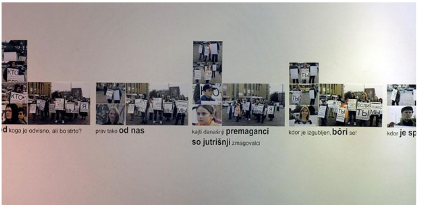
Chto delat?/What is to be done?, Angry Sandwich-People or In praise of Dialectics , 2005. Installation view from the exhibition "Prekinjene zgodovine/Interrupted Histories," Moderna galerija, Ljubljana, 2006.