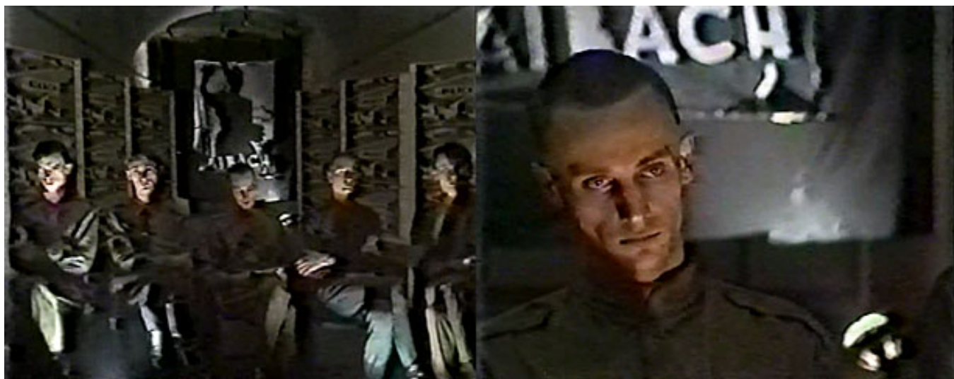
Laibach, Interview, June 1983.

But for Kierkegaard the new is a difference without a difference or a difference beyond difference – a difference which we are unable to recognize because it is not related to any pre-given structural code. As an example of such difference, Kierkegaard uses the figure of Jesus Christ. Indeed, Kierkegaard states that the figure of Christ