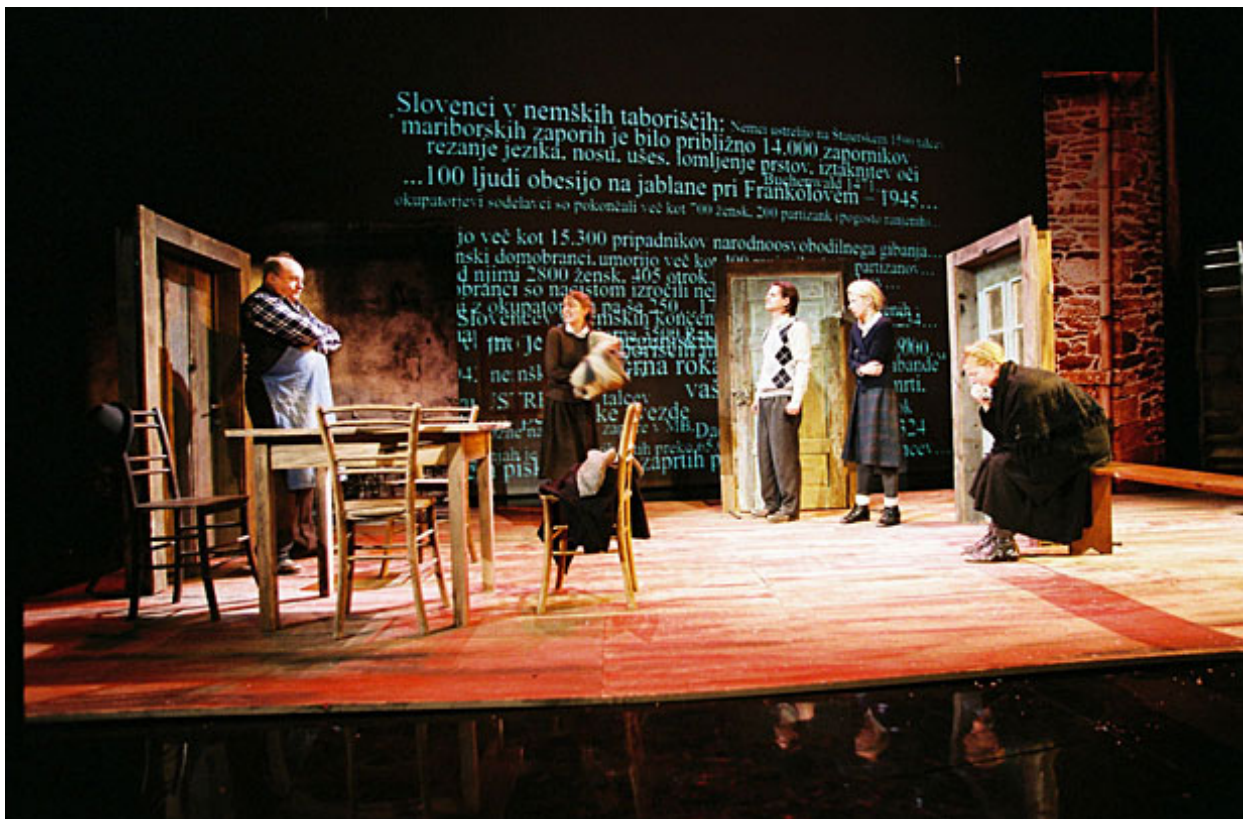
Matej Bor, Sebastijan Horvat: Ragged People (Raztrganci)/ Pupils and Teachers (Učenci in učitelji), production: E.P.I. center, MG Ptuj in Cankarjev dom, 2007.