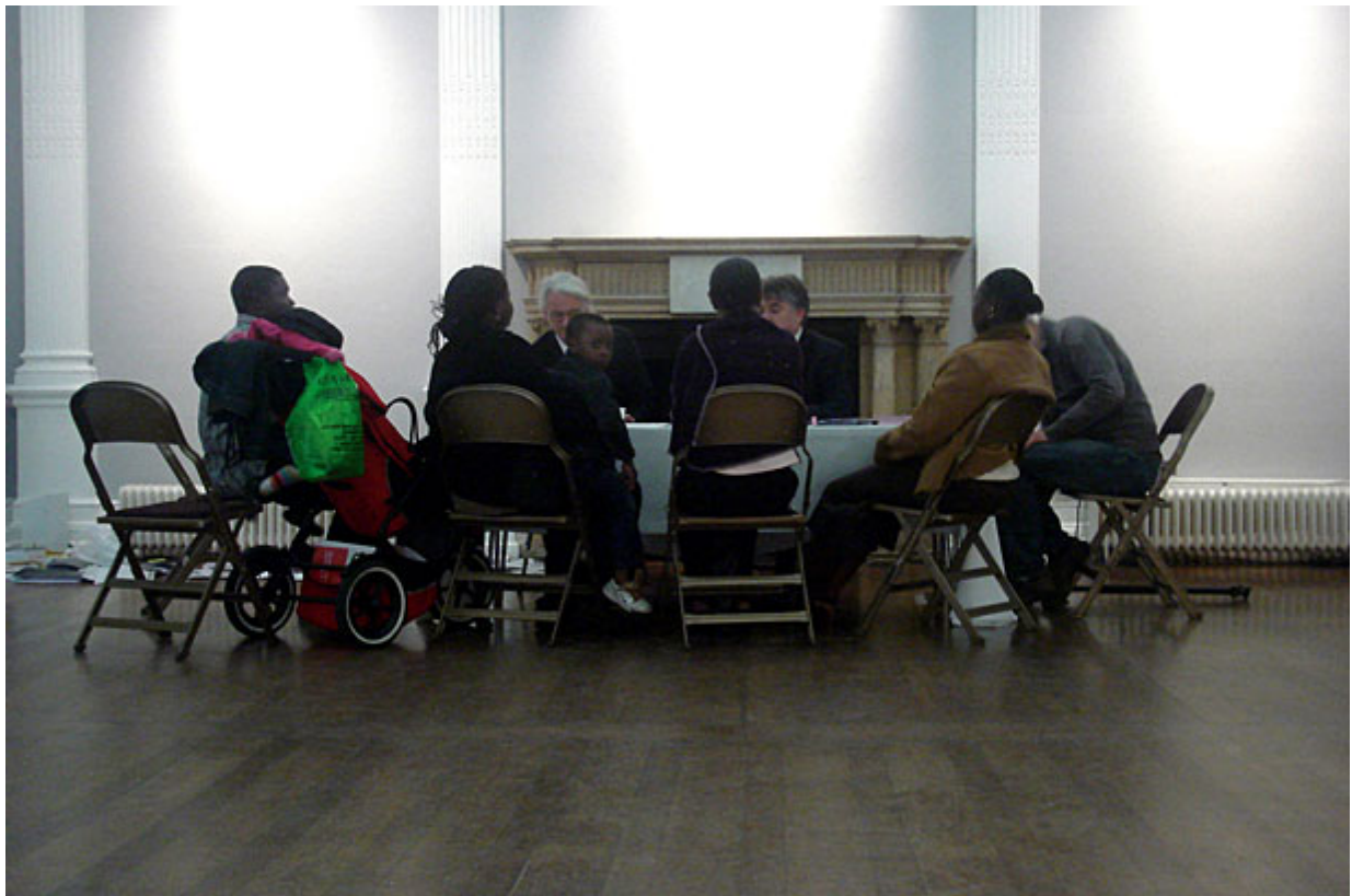
IRWIN, NSK Passport Holders, 2007-2008.

Eastern European artists are interested in gestures associated with historical situations that have certain features we see repeated today. The present financial crisis is in many aspects comparable to the one in the 1930s, which precipitated both the rise of the fascist movement and the radicalization of leftist positions. The Croatian curatorial group What, How & for Whom (WHW), which is curating this year's Istanbul Biennial, has linked the biennial's concept to the social and political context of the pre-World War II era as treated by Bertolt Brecht in his plays; as WHW points out, this era bears a strong resemblance to the present period of pseudo-morality, fast-growing poverty, and repression. The title of this year's biennial is borrowed from the song "What Keeps Mankind Alive?" from Brecht's revolutionary Threepenny Opera (1928). In its concept statement, WHW highlights the fact that Brecht's play is itself a repetition, or adaptation, of John Gay's The Beggar's Opera , from the eighteenth century, the period of early industrial capitalism, which in