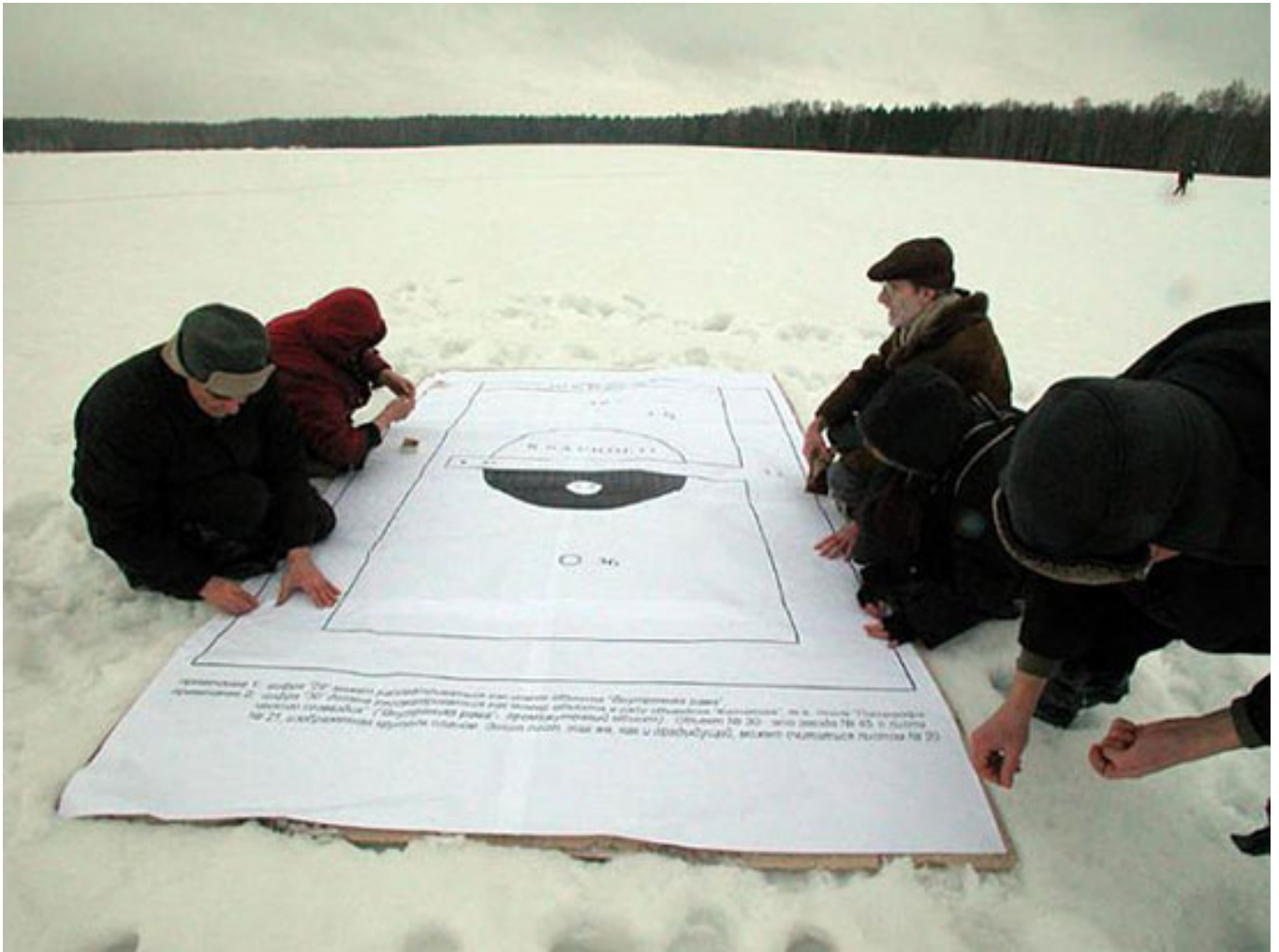
Collective Actions, Voyage to Saturn , 2004. Performance.