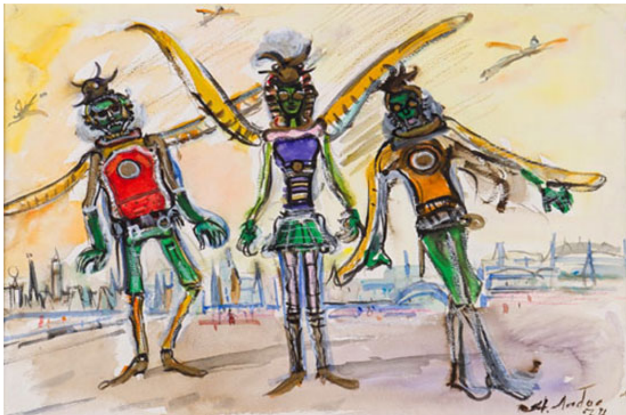
Alexander Labas, Aliens: Variant , 1974. From the series The Inhabitants of Distant Planets .

With cosmism's influence on Russian, Soviet, and post-Soviet art, the historical avant-garde emerges in all its diversity, including Vasily Chekrygin's futurism, Pavel Filonov's analytical art, Malevich's suprematism, Kandinsky's abstractionism, and Alexander Labas's utopian subjects. In addition, cosmism had a direct impact on the intuitive artists immersed in Eastern spirituality, for example, the group Amaravella (Sanskrit for "sprouts of immortality"), which was close to the circle of the artist, traveler, and superstar mystic Nicholas Roerich. Amaravella's aesthetic views and esoteric paintings, produced in the 1920s, were ignored by the general public and scarcely had any chance of surviving in postrevolutionary Russia, where all other subjects would soon be wholly displaced by the all-powerful Socialist Realist canon.