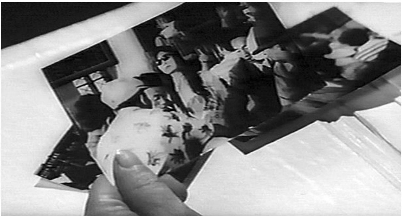
Unsung Heroes , North Korean Film Series, DPRK, 1981.

A curator shoving a card in another curator's face interrupts your discussion. Talking about her plans to do an exhibition of Hungarian artists