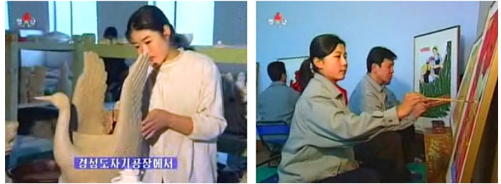
Evening News, North Korean State Television, February 2009.

I can talk about “dematerialized” art because I have seen it in books. But I never experienced it. Conceptual art was communicated by means of postcards, faxes, and magazines before I was born, and I read about it years after it was made.