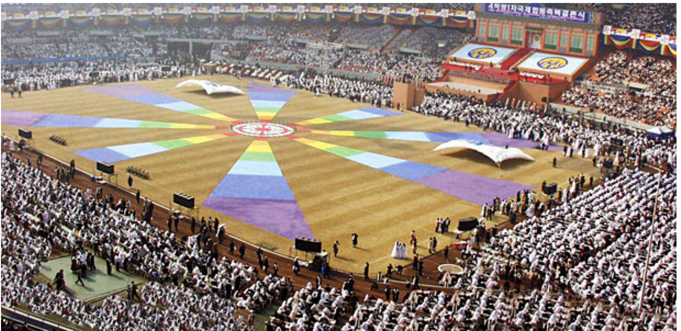
Mass Wedding Ceremony, Unification Church, South Korea, 2000.