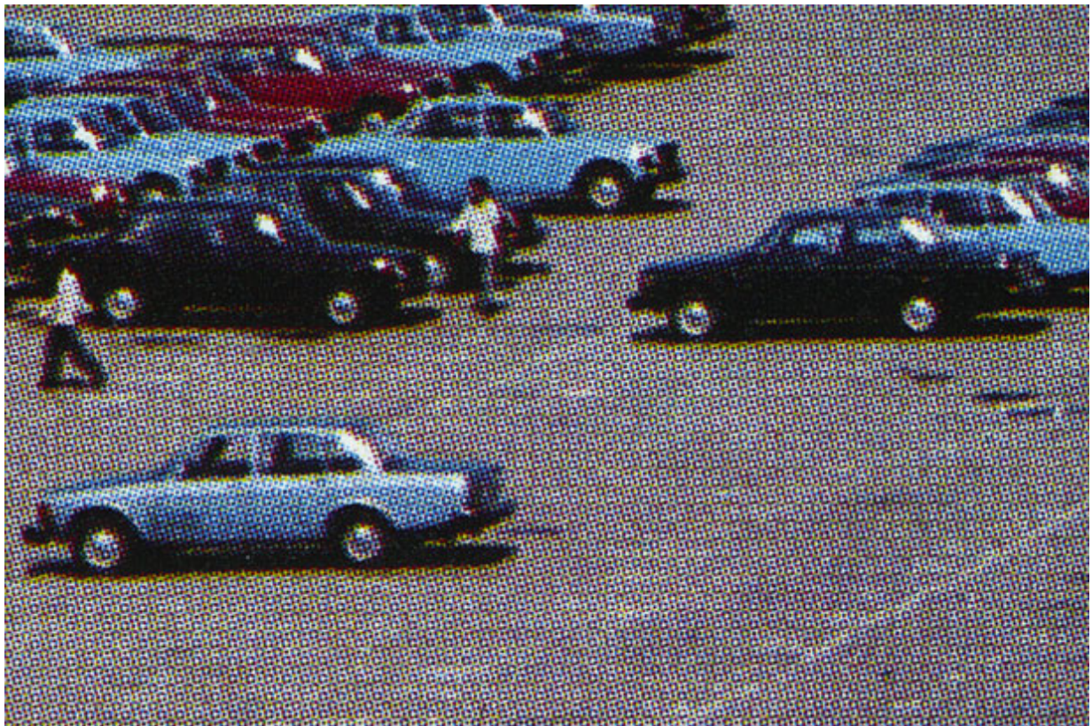
Detail from DPRK publication, Volvo 144s, 1989.