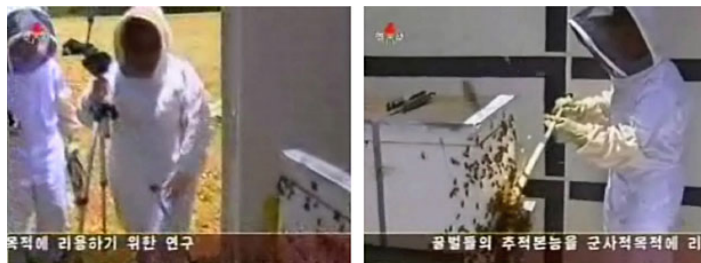
"News of the World," North Korean State Television, January 2009.

Much the same confusion predominates in the art world, whose idealism wouldn't exist without a basis.