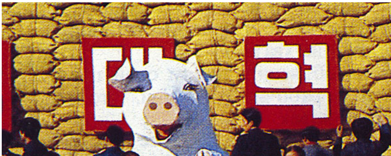
Harvest Festival, Korea Monthly Magazine, DPRK, 1986.

I thought you said your work includes photography. Why don't you have camera