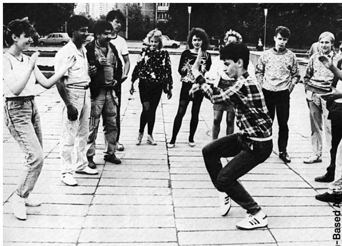
Disobedience in Byelorussia, Soviet Life Magazine , November 1988.

As I write, I will not assume the role of the artist, but more that of a cartoonist. I will enter a state of psychosis for a few days in an attempt to explicate in the form of satire and caricature the notion of “context” and its relation to art, occasionally fluctuating between scientific and clinical terminology (applied arbitrarily).