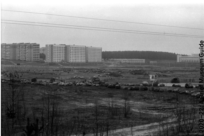
Photograph depicting the Museum of Stones in Minsk, Belarus, date unknown.