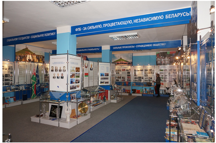
The Museum of the Federation of Trade Unions of Belarus, Minsk.

e-flux journal #127 — may 2022 Aleksei Borisionok Queer Temporalities and Protest Infrastructures in Belarus, 2020–22: A Brief Museum Guide