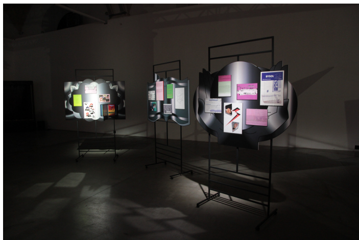
Problem Collective, Information Boards , 2021. View of Every Day: Art, Solidarity, Resistance , Mystetskyi Arsenal, Kyiv, Ukraine, 2021.

According to cultural theorist and practitioner Valeria Graziano, prefiguration or prefigurative politics describes situations in which the organizing principles behind social movements, including their political agency and