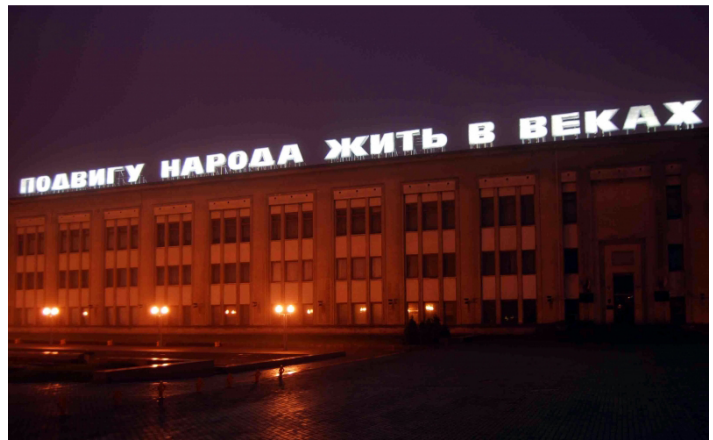
Sign on the facade of the Belarusian Great Patriotic War Museum in Minsk, Belarus that reads, the act of people's bravery to live forever.

e-flux journal #127 — may 2022 Aleksei Borisionok Queer Temporalities and Protest Infrastructures in Belarus, 2020–22: A Brief Museum Guide