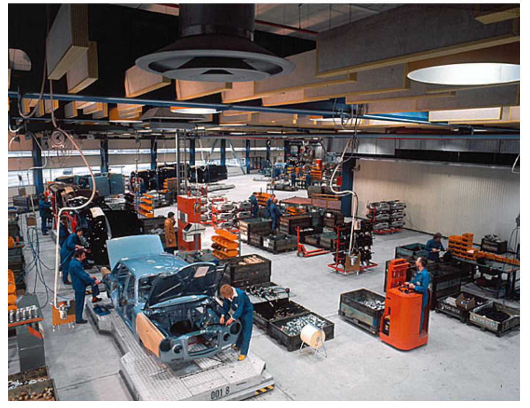
Production in the Kalmar plant, which produced cars for Volvo between 1974 to 1994.