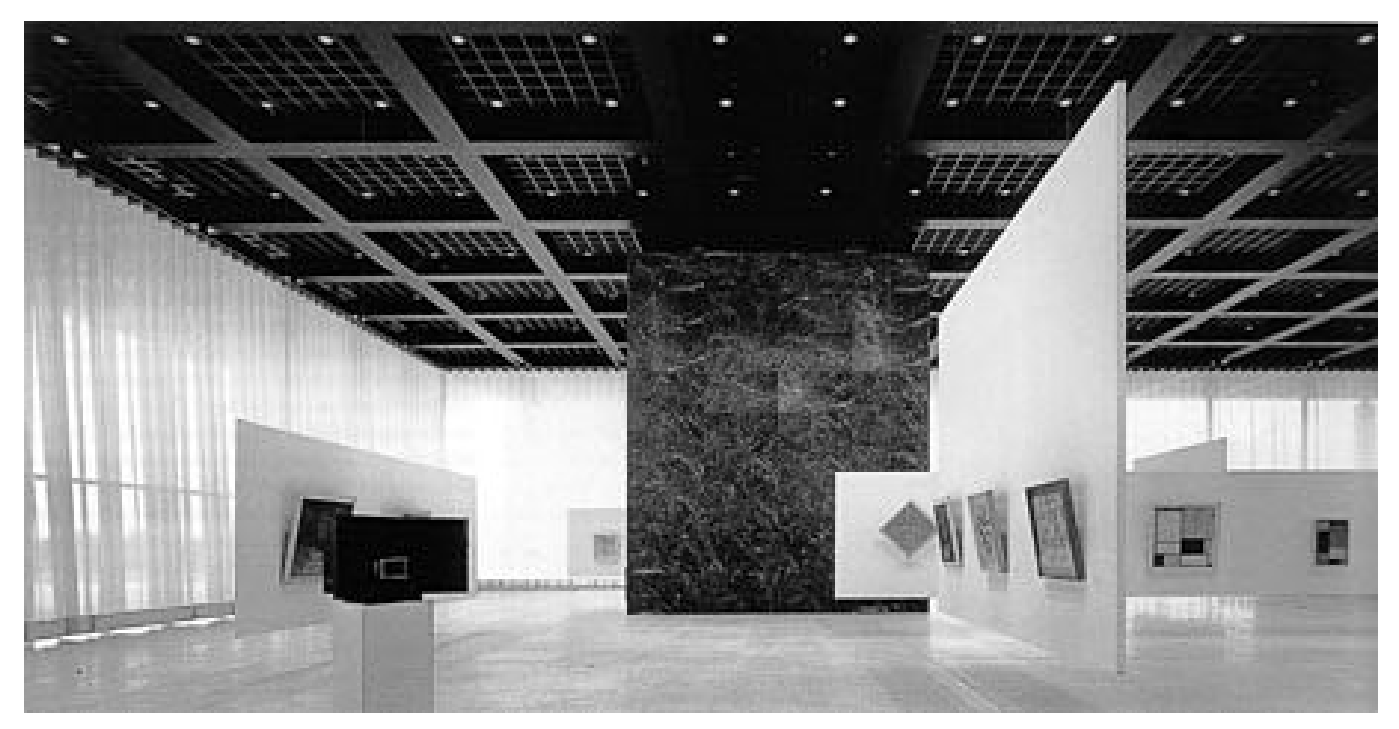
Neue Nationalgalerie, Berlin