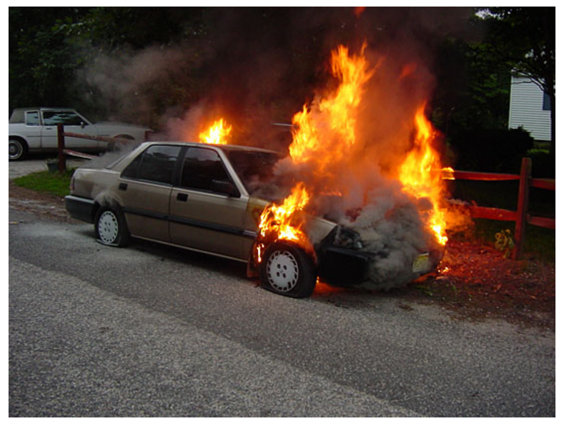
Car fire, unidentified, 6/24/2004

The idea has become that it is essentially better to manage your own time within a framework that involves limitless amounts of work, with no concrete barrier between working and non-working. This is something that