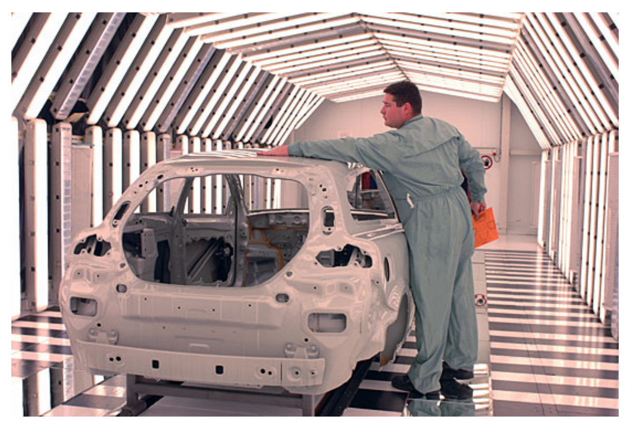
Production/manufacturing of the Volvo C30 at the Volvo Cars plant in Ghent, 2006.

I have worked on the "Volvo question" for the last few years. Most of my research on Volvo has been done through Brazilian academic papers concerning the legacy of 1970s production techniques in Scandinavia and models of flexibility, collaboration, and the idea of a better working environment in an ideally productive post-Fordist context. There has been