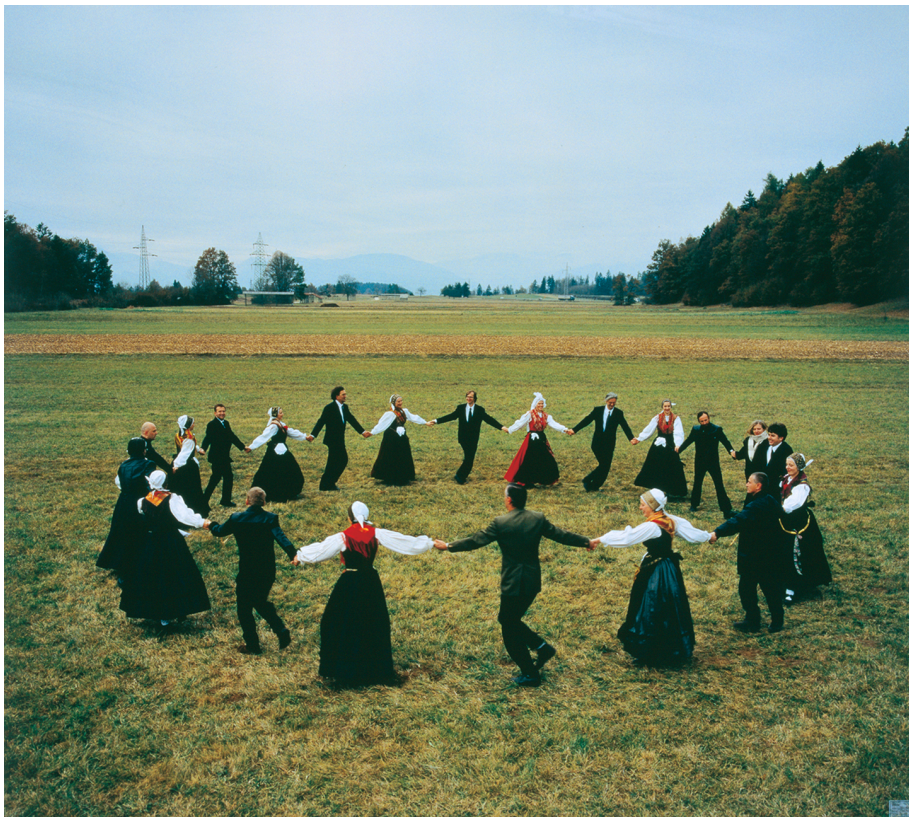
IRWIN, NSK Panorama, 1997.