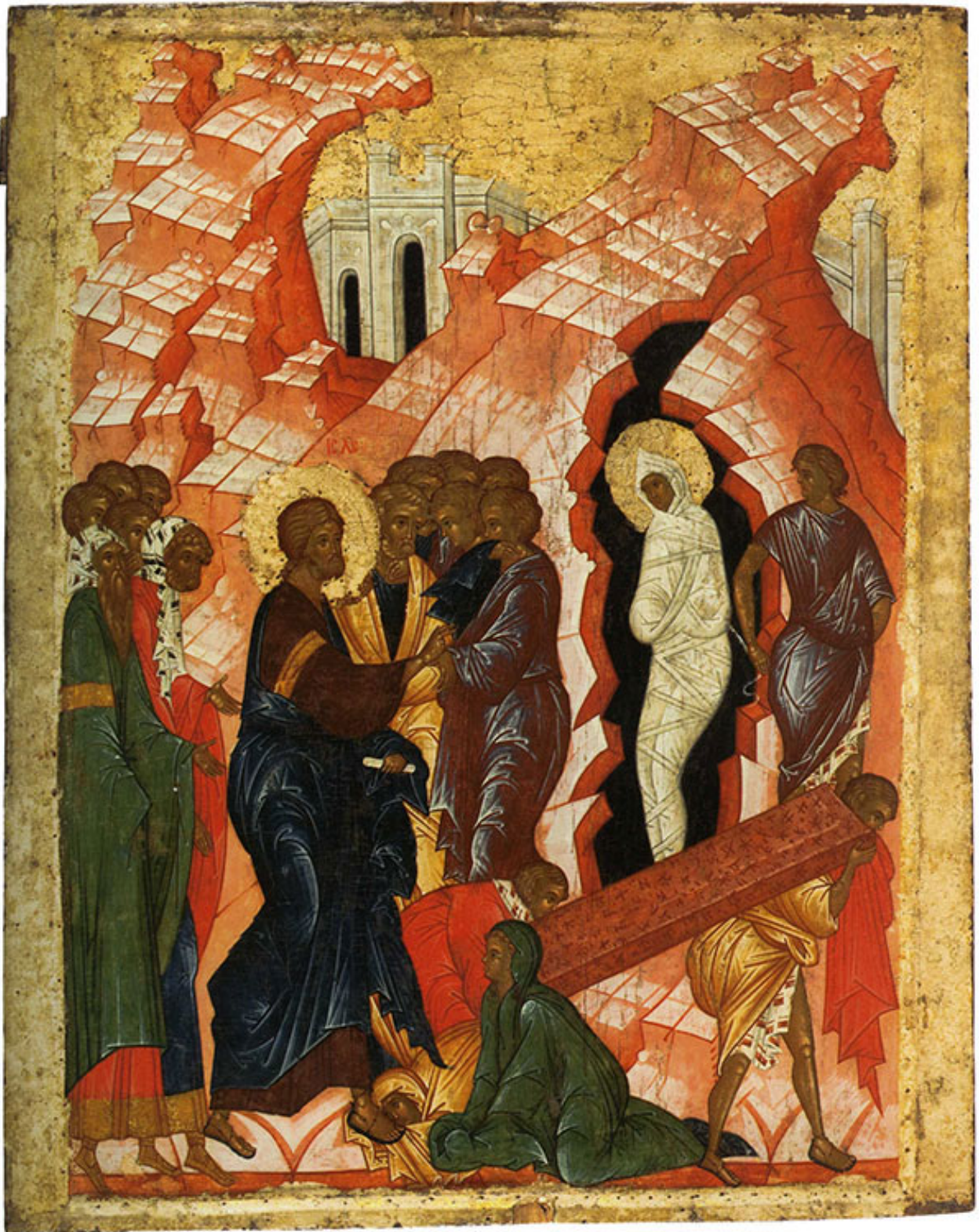
A Russian icon from the Novgorod school The Raising of Lazarus , 15th century. 72 x 60 cm. The Russian Museum, St. Petersburg, Russia.