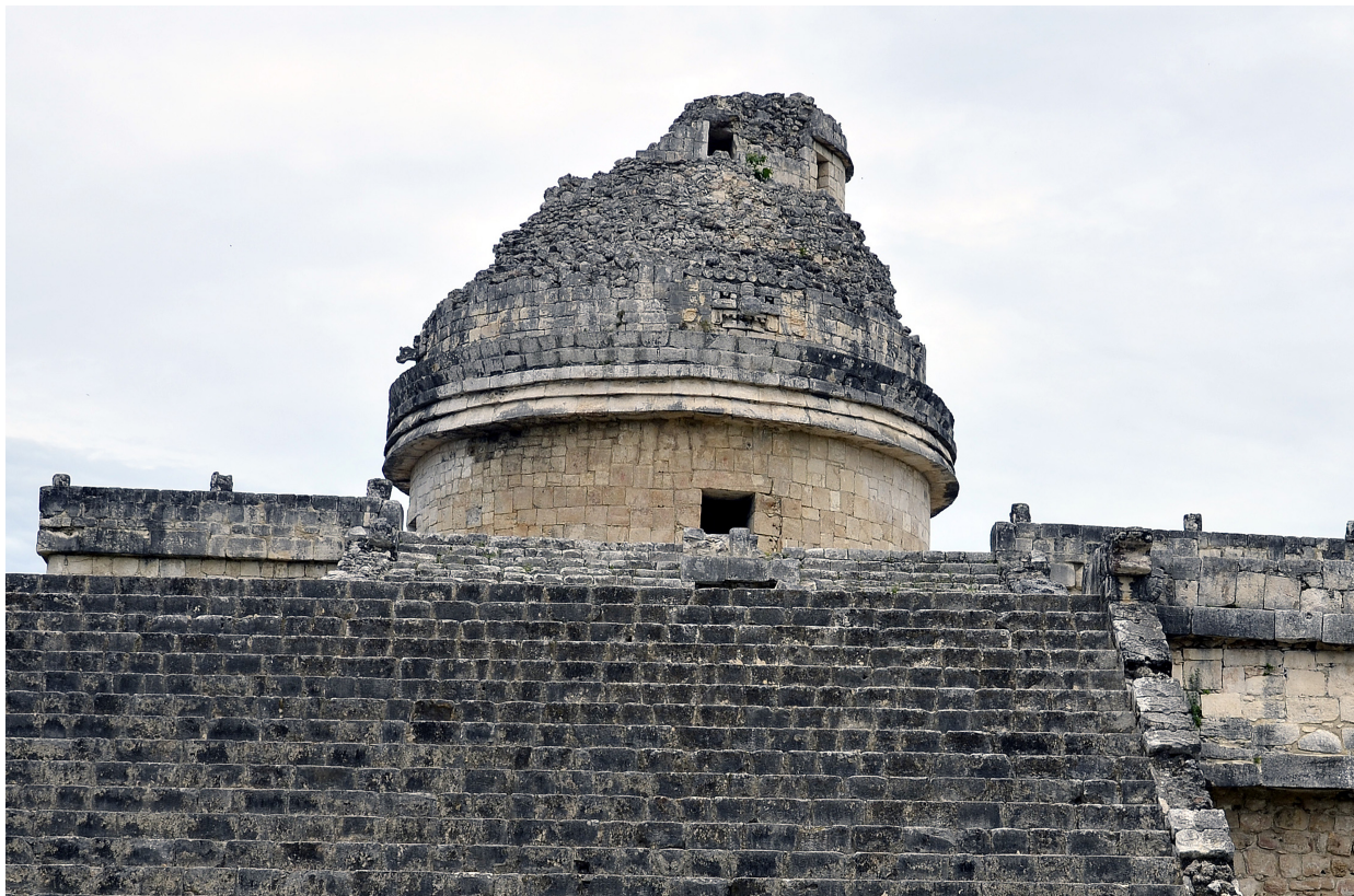
The Caracol Tower, Chichen Itza, Mexico.

There is a passage in Malevich's writing where he speaks of suprematist compositions as