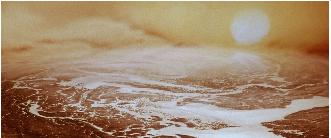
Film still from Andrei Tarkovsky's 1972 movie Solaris .