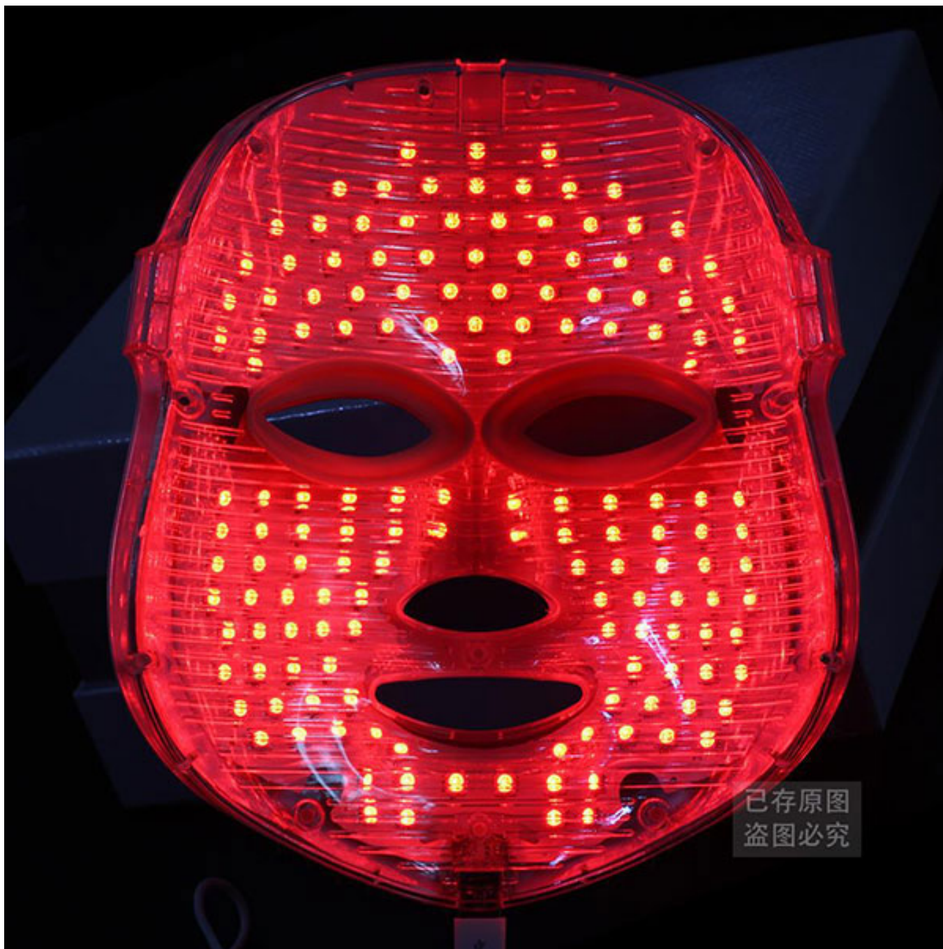
An Alibaba LED facial mask promoting "skin rejuvenation therapy" and "anti-aging wrinkle removal." See https://www.aliexpress.com/item/32618827583.html .