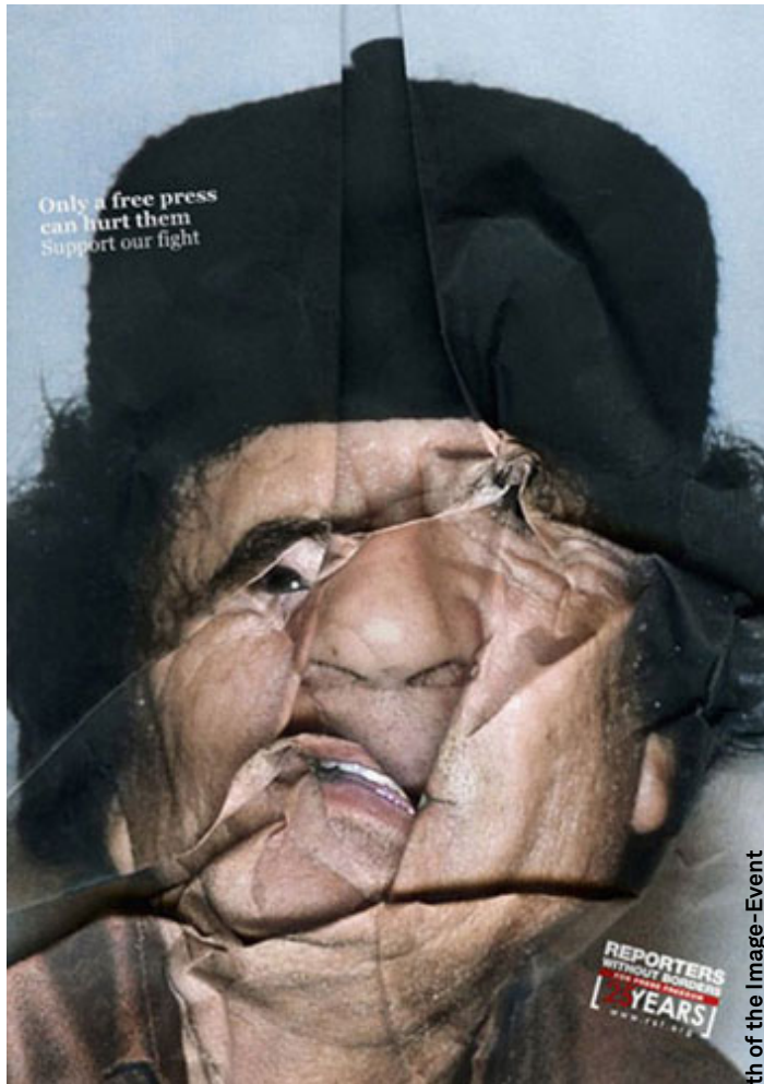
Campaign image from Reporters without Borders .

moment of death: those who watch CNN are survivors, while those who don't are either dead or potentially dead.