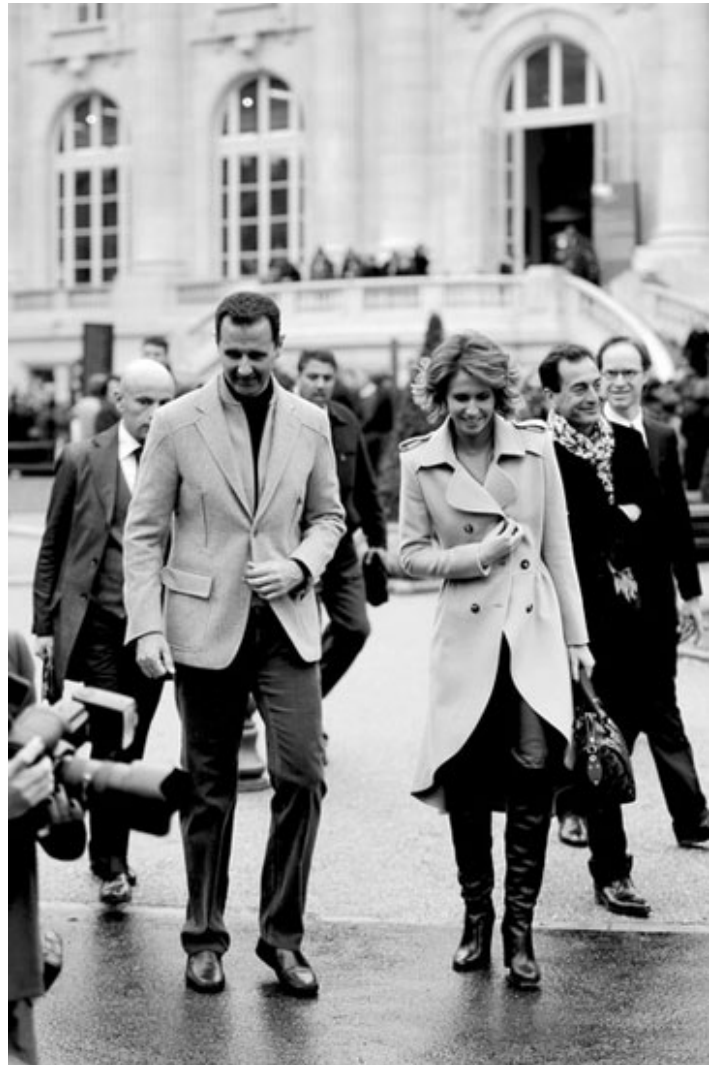
The lack of images from any type of news coverage in Syria contrasts with the many images of president Bashar al-Assad and his wife Asma, such as this one from Getty Images. Here the couple leaves the Grand Palais after visiting the exhibition dedicated to Claude Monet on December 9, 2010 in Paris. Al-Assad is on a two-days official visit to France.

By turning the image into an autonomous event, the Syrian rebels were able to safeguard its meaning. They succeeded in guiding the process of interpretation while they claimed and endorsed the images of their own deaths. From now on, no state, people, or group has a right to tell them what is best for them, or whether their president is a reformer. The Syrian rebels now