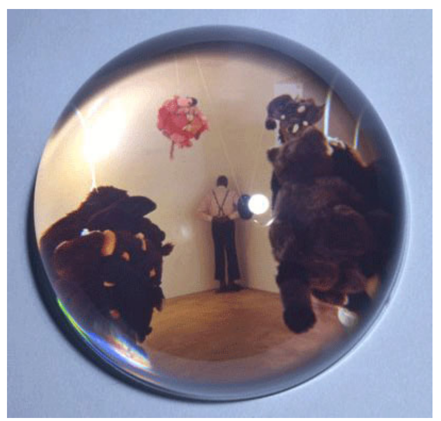
Louise Lawler, Untitled (Martin and Mike), 1992. Cibachrome, crystal, and felt paperweight. Courtesy the Artist and Metro Pictures.

It is in the construction and use of this discourse that the distinction between curator and artist become blurry. The discourse or thesis of the curator may contradict the discourse of the artist, because the curator extrapolates from the presentation of artworks in a way that is not necessarily determined by the artists' original intentions. Accordingly, the exhibition becomes a meta-creation that uses specific creations by