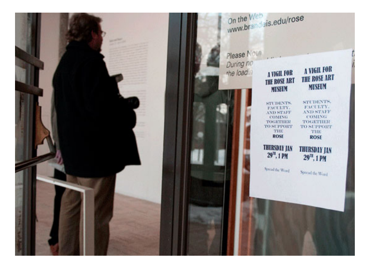
Vigil at the Rose Art Museum.