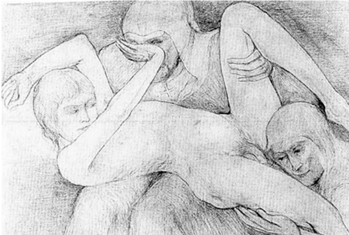
Pierre Klossowski, Le Jeune Ogier Chez les Frères Chevaliers du Temple , 1971, graphite on paper.

I finally left the kettle that evening shortly after 11:00 p.m. Each of us were allowed to leave one-by-one and forced to do a "walk of shame," as one of my perceptive students so aptly described it. We had to walk single file down a long line of riot police, remove any headgear (or have it ripped from our heads), and finally pass before a police camera in the full glare of its lights and winking red operation button. There was no equivocation. We were being treated as criminals, our appearance captured on video to be played back against hours of police footage, and processed through face-recognition software.