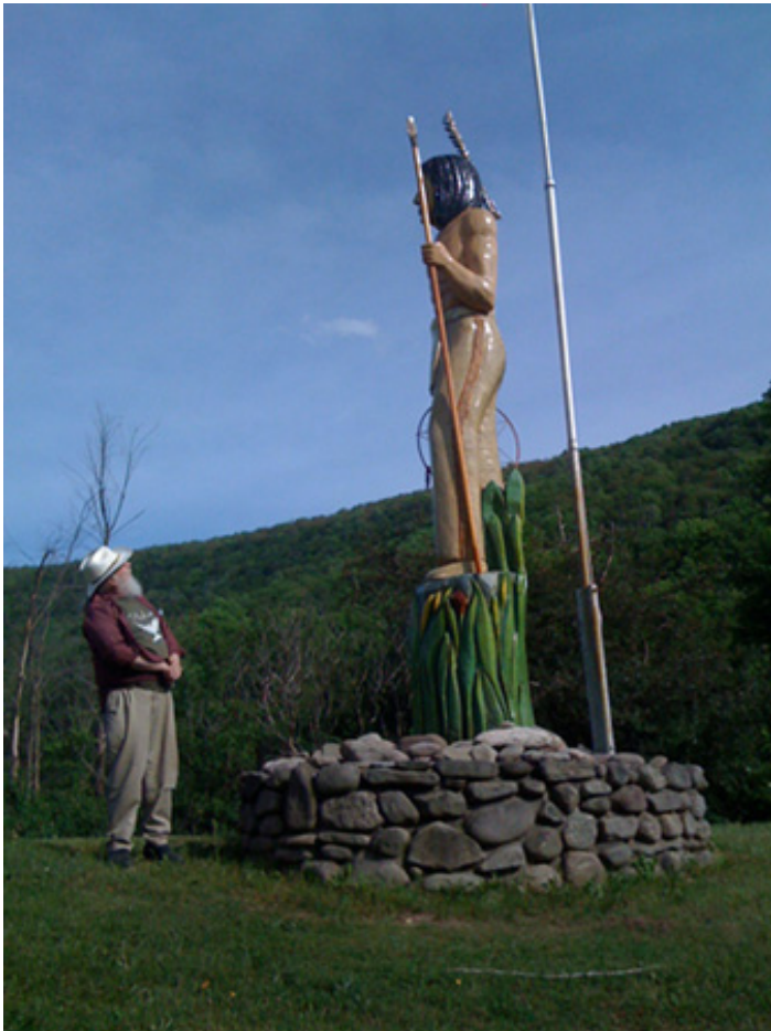
Hakim Bey visiting Big Indian, Shandaken, New York State.

HUO: It sounds like these mapping projects have a lot to do with memory. The historian Eric Hobsbawm always speaks about a protest against forgetting, and Rem Koolhaas suggested to me recently that amnesia might be at the very core of the digital revolution. It seems that with more and more information, there might be less and less memory. Would you agree? Has it become urgent now to protest against forgetting?