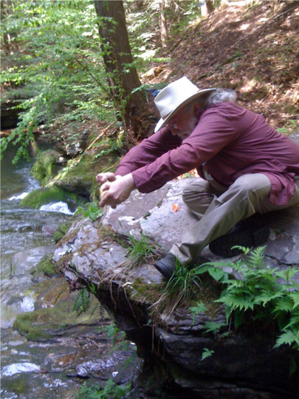
Hakim Bey, Otter falls art action , 2010, disappearing artwork.