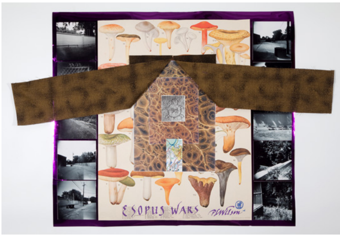
Hakim Bey, The Esopus Wars , 2010, mixed media (map, box, and Canto VI of Riverpeople), concerning the seventeenth century wars between the Dutch and the native Esopus Indians.

HUO: Do you also see it as anti-democratic?