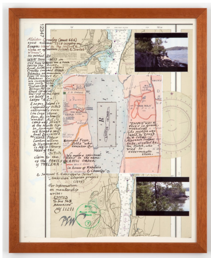
Hakim Bey, Esopus maps #2 , 2010, mixed media.