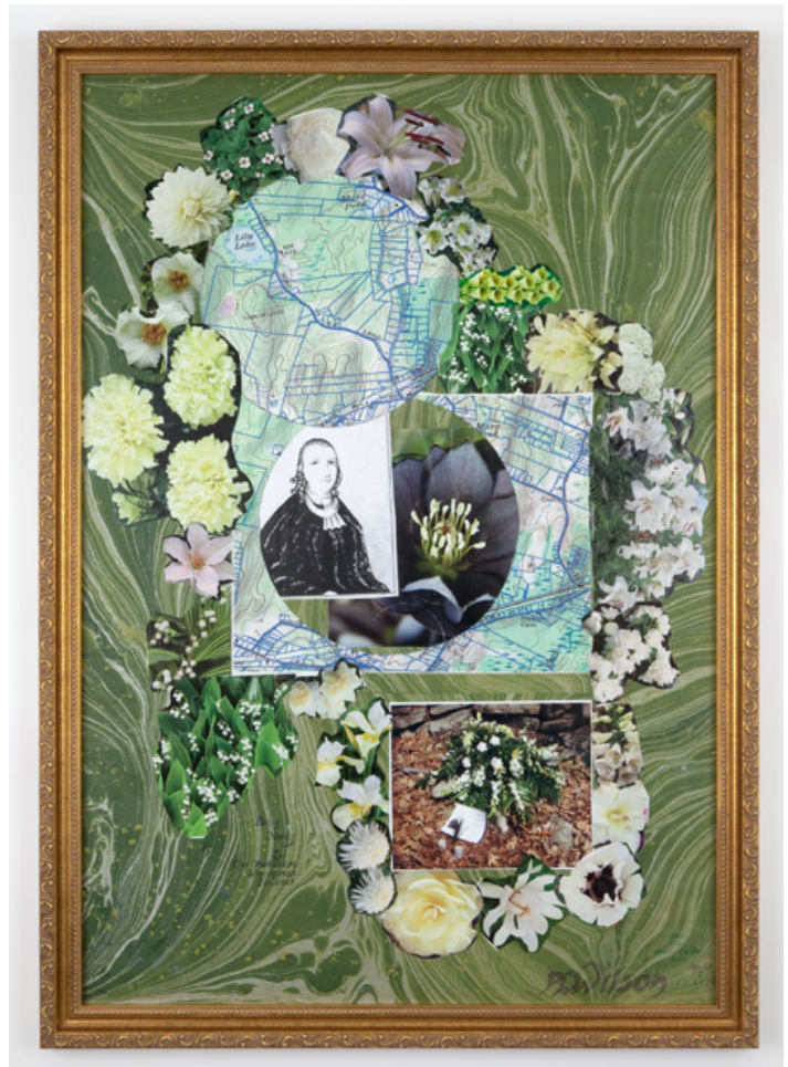
Hakim Bey, Pang Yang & the Universal Friend , 2010, mixed media. The Pang Yang action itself (April 7, 2010) consisted of taking an expensive funeral flower arrangement of white blossoms to the graveyard in Pang Yang and leaving it there to decay.

HB: Money certainly had something to do with it. I mean, the Shiraz Festival of Arts offered so much money that every good left-wing artist in the world couldn't say no, with a few noble exceptions, I would say. There were some who didn't come. The Living Theatre never came. John Cage, sure, he came. So did Merce Cunningham, Karlheinz Stockhausen, the list goes on. Everybody came because there was incredible money. They would tell Stockhausen, "Come and put on every piece of music you ever wrote, in a beautiful town in the desert of Iran with minarets and domes and camels in the courtyard." And how can anyone resist this!