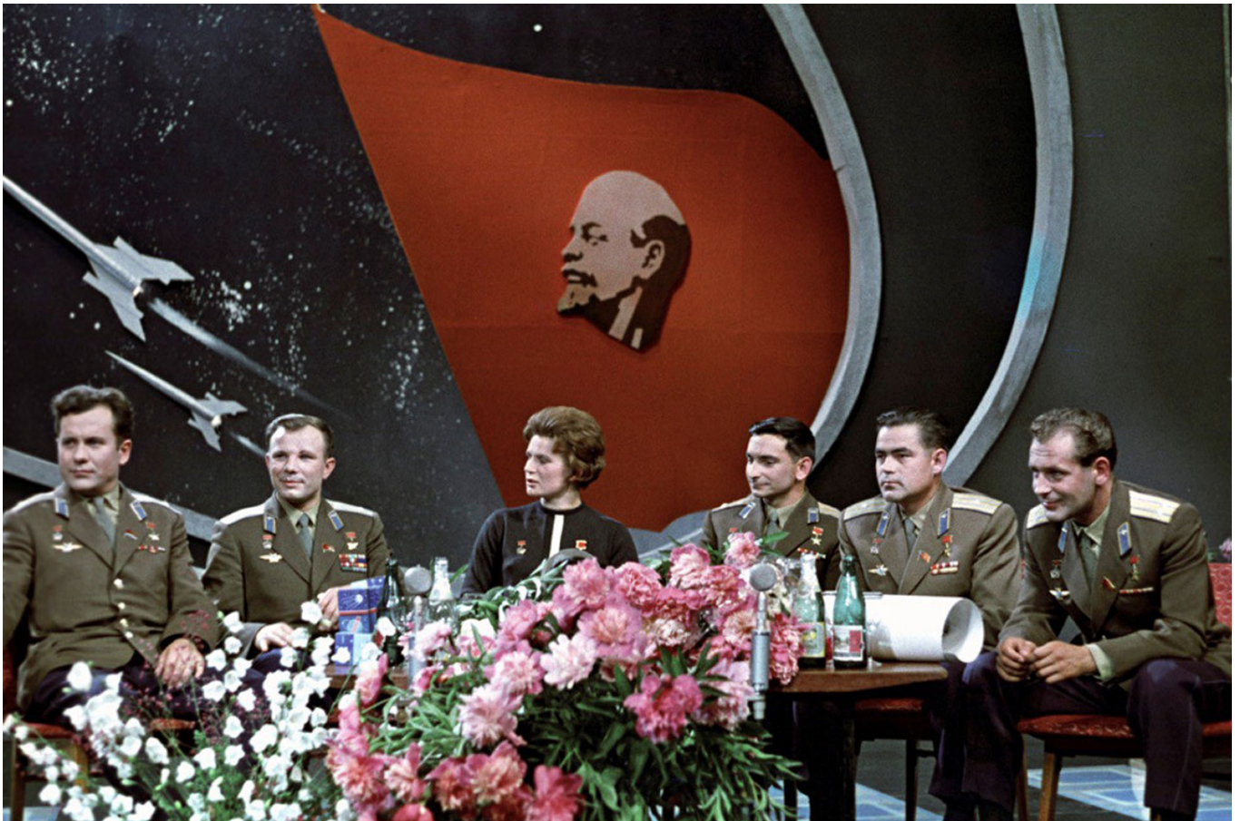
Soviet astronauts at a TV studio in 1963 (from left to right): Pavel Popovich, Yuri Gagarin, Valentina Tereshkova, Valery Bykovsky, Andrian Nikolayev, and Gherman Titov.