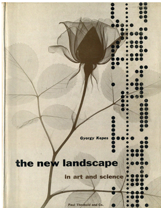
Cover of György Kepes's 1956 book The New Landscape in Art and Science .