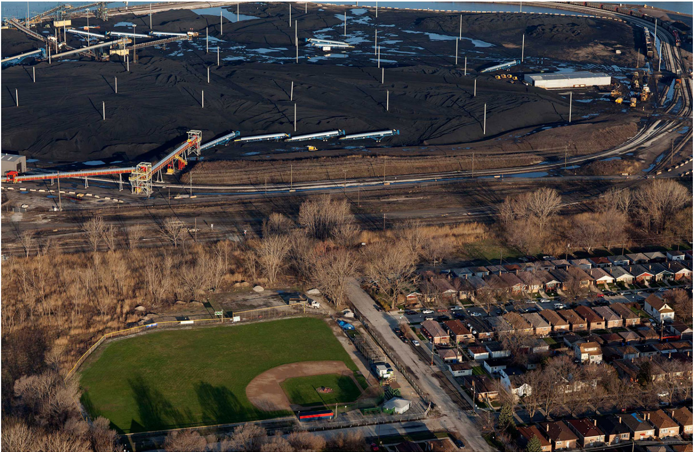
Terry Evans, Koch Brothers Petcoke Pile Near the Neighborhood , 2015.