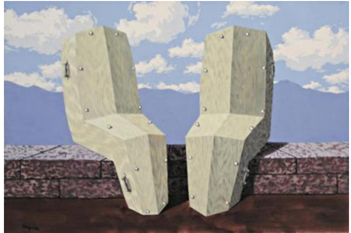
René Magritte, Par un belle fin d'après midi , 1964, gouache on paper, 36x54.5 cm.

one that leads to a promise of liberating desire from being “stalemated in a fixation.” 23 I find this rather problematic, however, because it suggests a space where neither power relations nor conflict nor violence need to be dealt with.