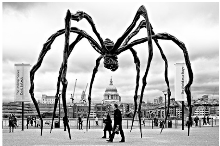
Louise Bourgeois, Maman , as installed at the Tate Modern, 1999-2000.