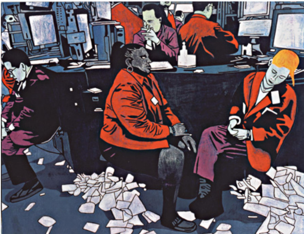
Alekos Hofstetter, Slump , 2002. Gouache on paper mounted on wood, 80 x 103 cm.

I ask these questions against the backdrop of queer theory in general, and in particular of having co-organized a conference on economy and sexuality. Heteronormativity and desire are categories central to queer theory. The former provides an analytical tool used to explain how heterosexuality and the rigid binary distinction of