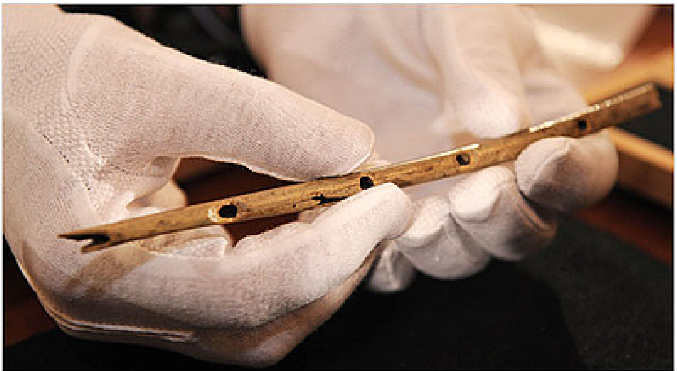
A cane fife, made by the late Othar Turner of Gravel Springs, Mississippi. Turner was (perhaps the last) a master of American fife and drum

In considering this series of examples, one is struck by the fact that such a utopia of music possesses a radicalism that the other ideal functions of the arts do not. While the other arts formulate maximums or optimums, it is always in relation to emerging or established social rules, and not as the suspension of those rules – which would be genuinely utopian. One might, then,