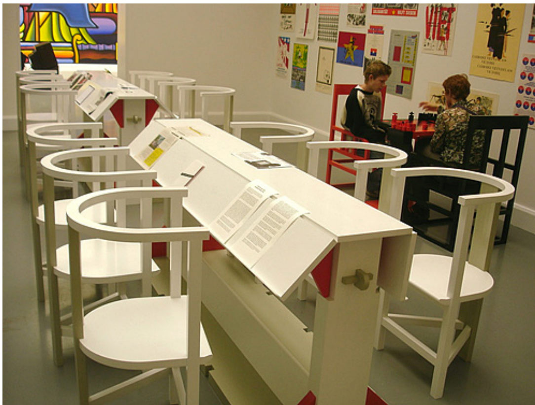
Aleksandr Rodchenko, Workers' Club , in “Forms of Resistance” at the Van Abbemuseum in Eindhoven, 2007.

Marx broke with the philosophical deadlock of idealism by using the dialectical method to analyze dialectical processes between classes . Lukács himself, however, gave a rather idealist interpretation to this materialist turn; as he later admitted, his explicit presentation of the proletariat as the identical subject-object of history was still highly idealist. 7 In his autocritique, he also argued that he had unduly equated reification with alienation , and