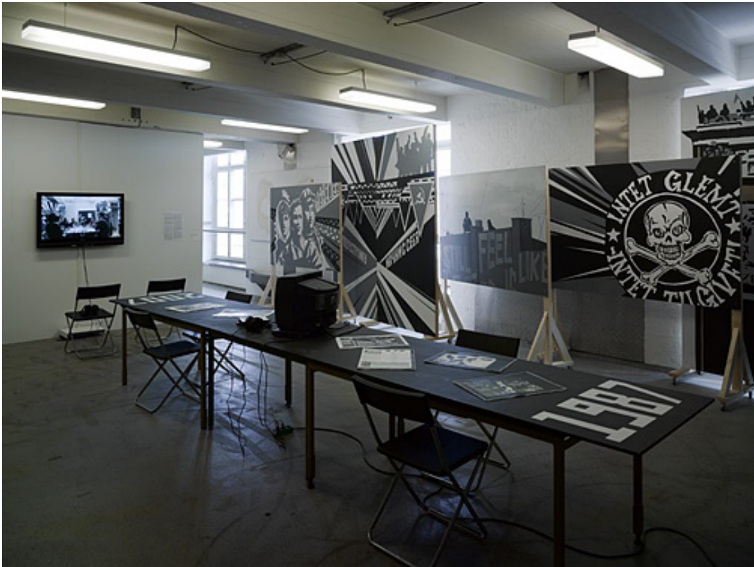
Chto Delat/What is there to be done?, "Representing Perestrojka," 2008, U-Turn Biennial, Copenhagen Denmark.