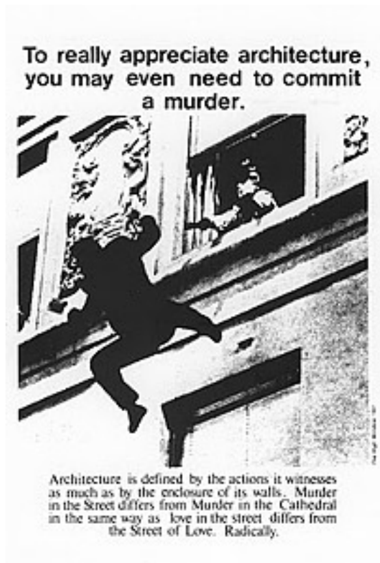
Bernard Tschumi, Advertisement for Architecture, 1977.