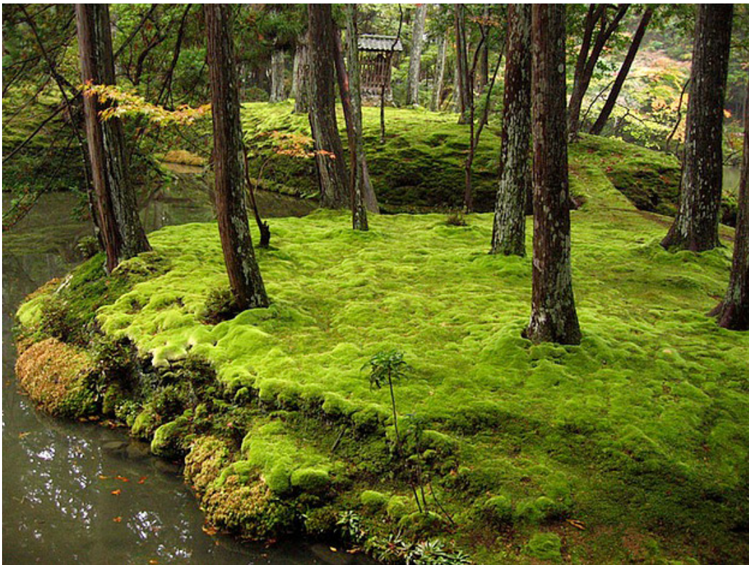
Saiho-Ji Garden, Kyoto.

And here, with Orwell, we are exposed to a "crisis of criticism": no matter how strong an argument might be for or against a work of art, the fact of a work of art's popularity, and the continuity of this popularity, supersedes any and all claims of substance. That is not to say that criticism has no import, but rather that its only import may be found in its ability to sway public opinion – which is in any event only secondary to sustained acceptance. This could be one of the ways in which men write history; however, this mode is still bound to the exigencies of chance, contingency, and context, which is to say that there is no super-agency to guarantee outcomes. One possible way to reject this system would be to quite literally break it, attacking the object's physical substance itself. Here though, instead of literary criticism, we would have the violence of iconoclasm. On the other hand, if it were