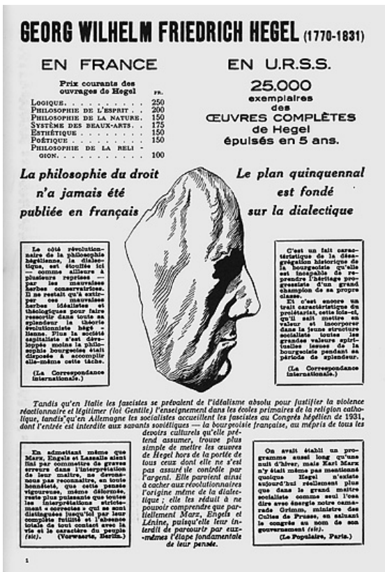
Drawing of Hegel's death mask from Le Surréalisme au service de la révolution .

One of the issues of Le Surréalisme au service de la révolution contained a montage of textual fragments on Hegel and Marx, which contrasted the lackluster number of Hegel's works available in French with the blockbuster sales of Hegel's complete works in the Soviet Union, informing us that "the five year plan is founded on dialectics." 15 In the middle of a page is a line drawing of Hegel's death mask; Spirit has become plaster. If the facts about the prices and sales of Hegel's works seem to fit into Aragon's quite linear remarks on spirit influencing things in the world, the death mask complicates things. As an outmoded relic of the nineteenth century, it is a Surrealist object par excellence, but it is hardly operative in the contemporary world – unless one