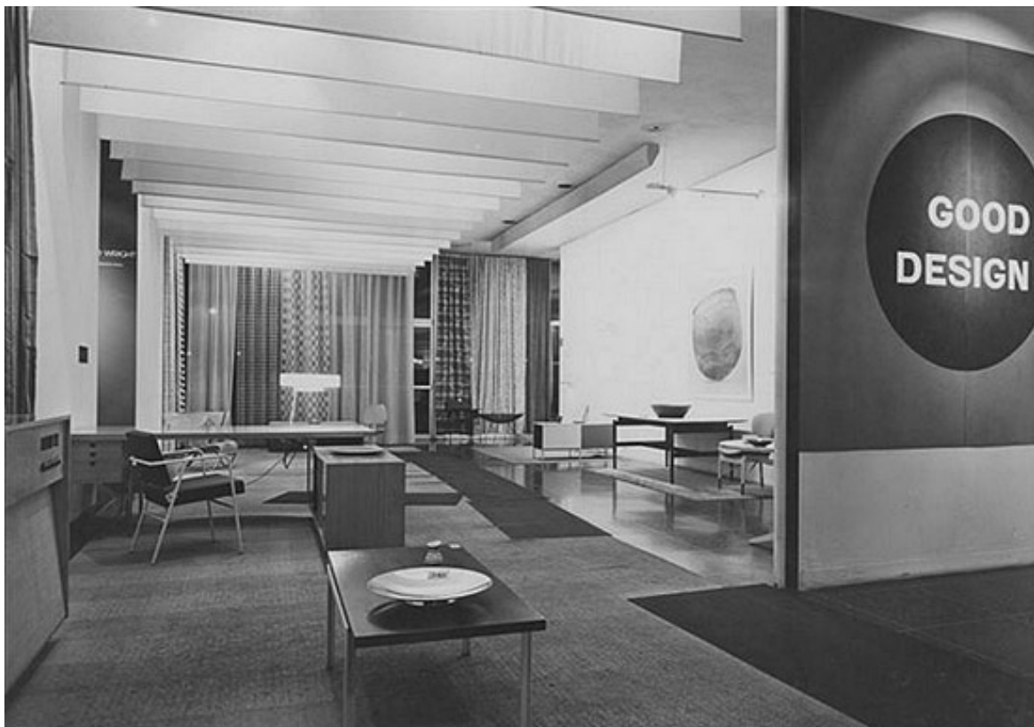
Installation view of the “Good Design” exhibition at MoMA, 1951–1952.

The rejection of the ready-made by critics and artists such as Greenberg and Newman was shaped by a fear of the collapse of categories, the fear of identity, of the work of art becoming just another “arbitrary” object. In addition to such critiques, which we may label conservative, the 1960s saw the emergence of a second strand of anti-Duchampian discourse. Its proponents were artists including Dan Graham, Robert Smithson, and Daniel Buren, and an important point that their different criticisms had in common was that Duchamp’s own practice was itself conservative in that it merely seemed to confirm and exploit the existing art-world structures and their power of definition. 10 Apparently working on the assumption that Duchamp’s work was fully accounted for by the then-emerging institutional theory of art, these artists felt that Duchamp merely used the institution(s) of art to redefine objects as artworks, thus multiplying their aura, their fetishistic allure, and their value. As Robert Smithson put it, “there is no viable dialectic in Duchamp because he is only trading on the alienated object and bestowing on this object a kind of mystification.” 11