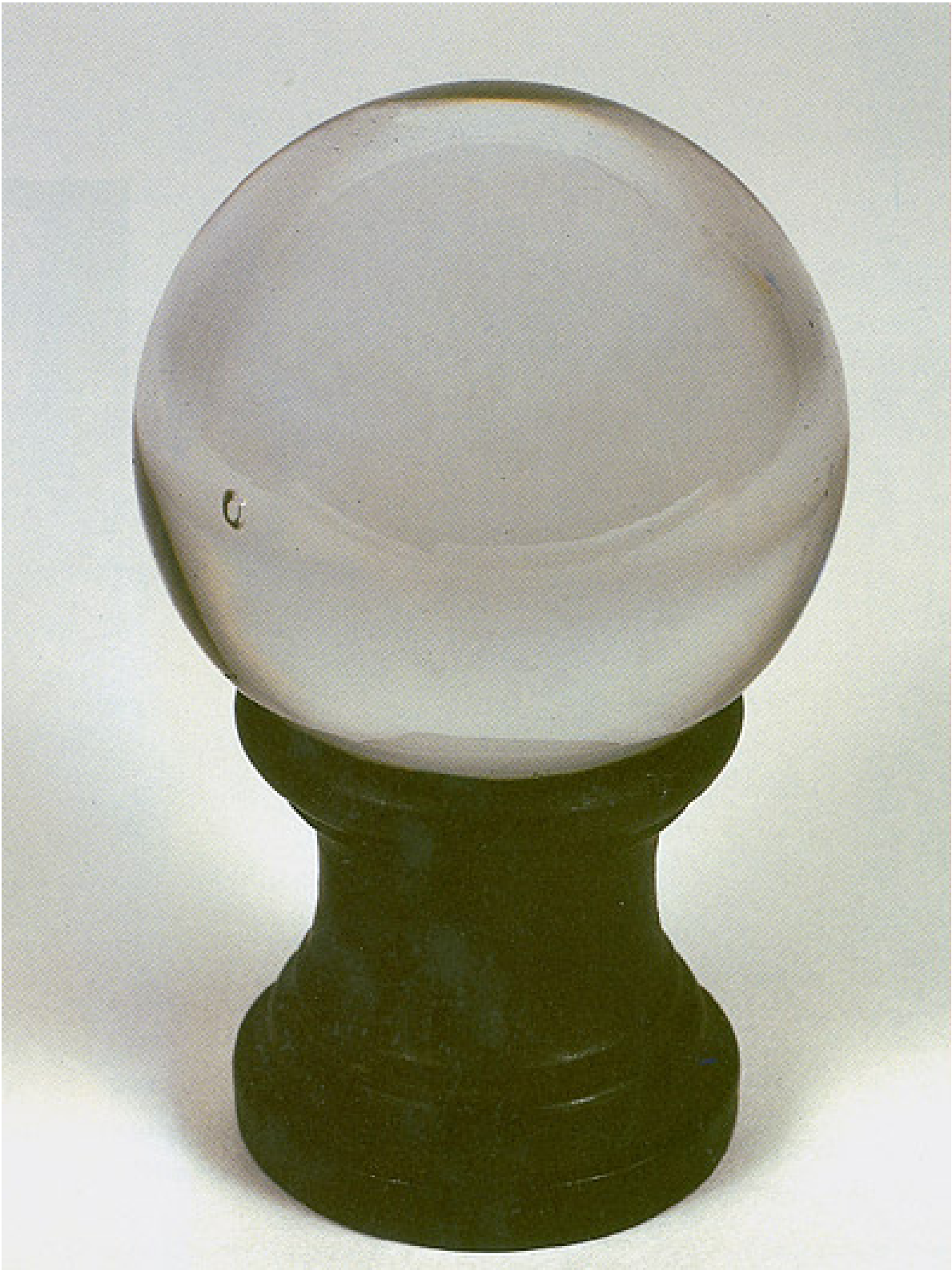
André Breton's crystal ball from the auction catalog André Breton. 42, rue Fontaine , 2003.