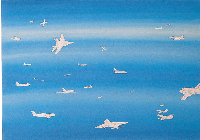
Alighiero Boetti, Cieli ad alta quota , 1989. Watercolor on paper mounted on canvas, 51 x 72 cm.

A “contemporary” manifesto could perhaps be perceived as a naïvely optimistic call for collective action, as we live in a time that is more atomized and has far fewer cohesive artistic movements. And yet there seems to be an urgent desire for a radical change that may allow us to propose a new situation, to name the beginning of the next possibility rather than just look backwards. In October 2008 this question was addressed in depth at “Manifesto Marathon,” a two-day “futurological congress” we organized in the Serpentine Gallery Pavilion in Kensington Garden, London. 4